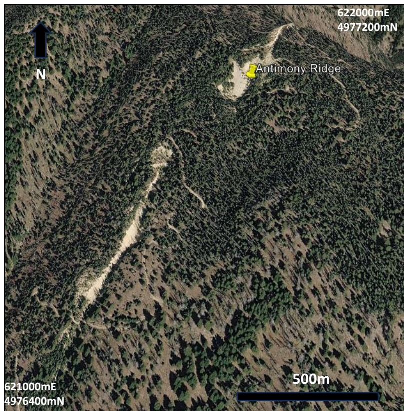
Figure 2: Antimony Ridge – Past open pits and trenches from WWI & II and Korean War, with access roads, in 3D satellite image looking NE.

Resolution is initiating a major Phase 2 drilling program in May 2026, at the Golden Gate Project, of up to 45,000 ft (13,700 metres) of diamond core drilling located within the Company's larger Horse Heaven Antimony-Tungsten-Gold-Silver Project. The program is designed to define the scale of gold and tungsten mineralisation at Golden Gate and Golden Gate South and support progression toward a maiden Mineral Resource Estimate.