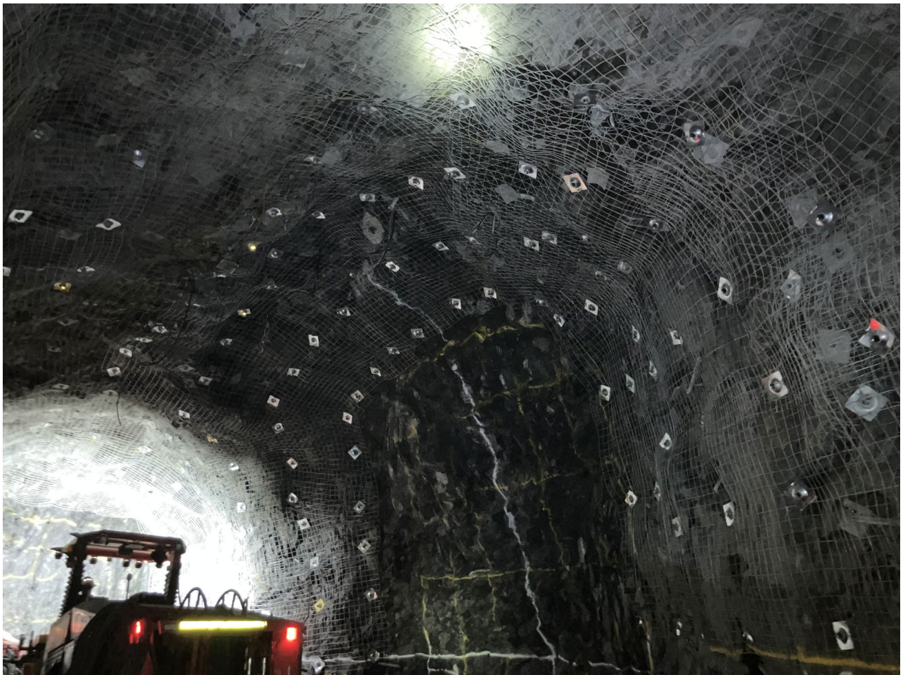
Figure 2 Underground Development - PYBAR Mining Services fully mobilised