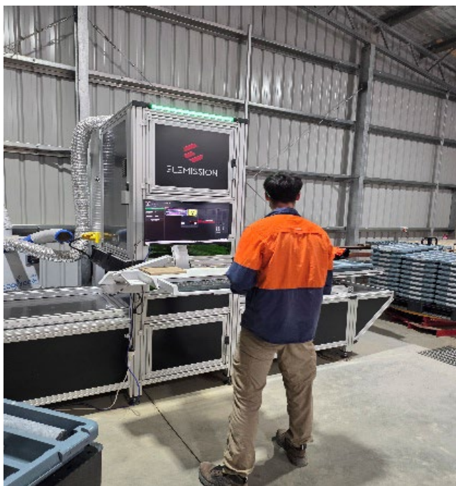
Figure 4 Elemission LIBS Laser Core Scanner in Operation