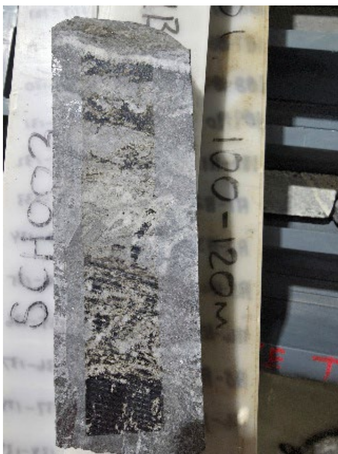
Figure 5 Scanned Core showing area ablated by LIBS laser (darker area) as part of the scanning process