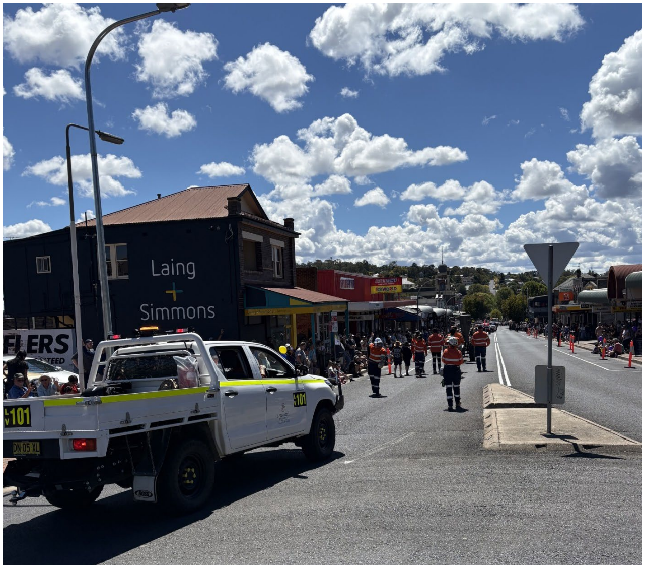
Figure 7 Hillgrove Employees participating in the 2026 Hillgrove Autumn Festival Street Parade