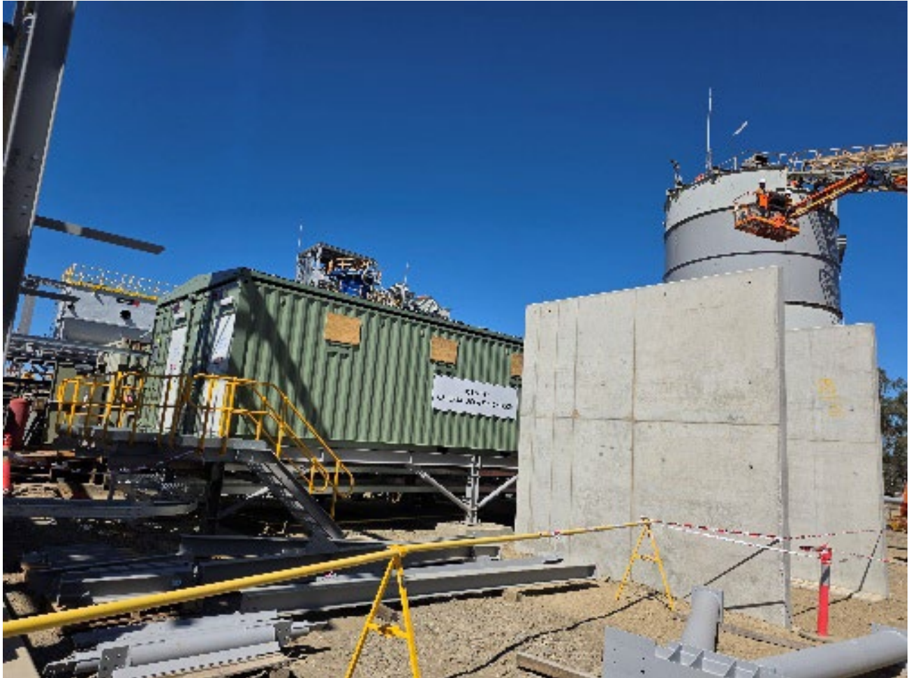
Figure 1 New Electrical Switchroom, concrete blast bunker for upgraded transformer and raised ore bin at rear

Site support and general operating procedures are being developed and implemented to prepare for the restart of the plant.