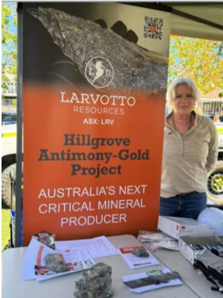
Figure 8 Larvotto Resources display at the Hillgrove 2026 Autumn Festival