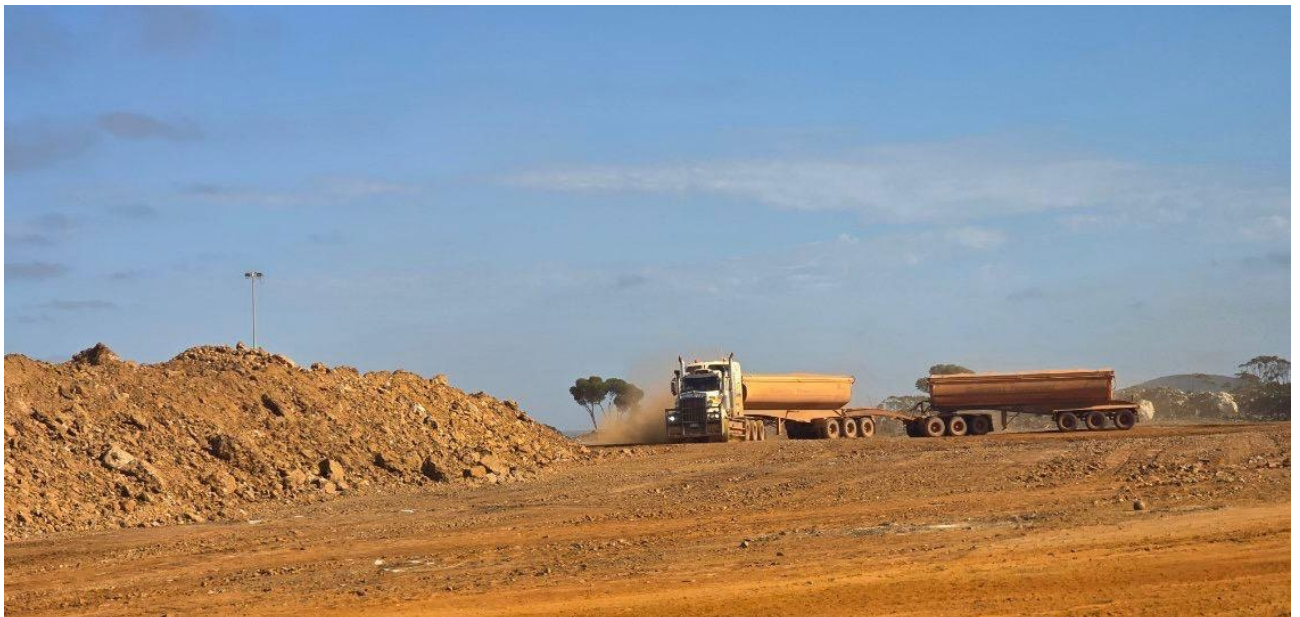
Figure 1: Material Haulage to Lake Johnston Processing Facility

Forrestania Resources Limited (ASX: FRS) ("Forrestania", "FRS" or "the Company") is pleased to announce that haulage to the Company's Lake Johnston processing facility has commenced from the British Hill project, ahead of forecast plant commissioning during the year.