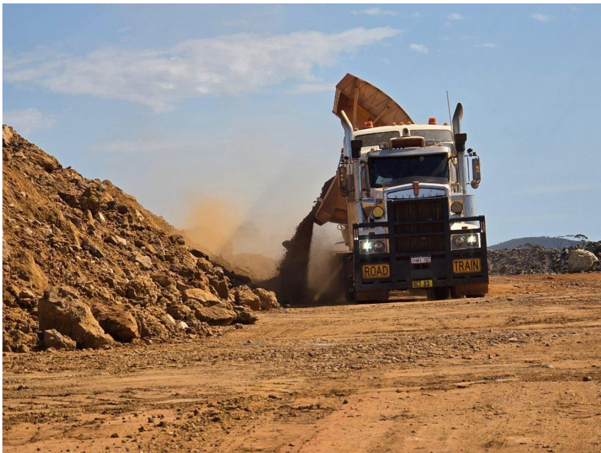
Figure 2: Trucking and delivery of First Ore to Lake Johnston

“We welcome the collaboration with Forrestania, and the support provided in upgrading the Hyden–Norseman Road which is a significant route for industry in the region and tourism. Our objective is for easy access for all users of this road, with planned upgrades and sealing sections of the route planned in future”.