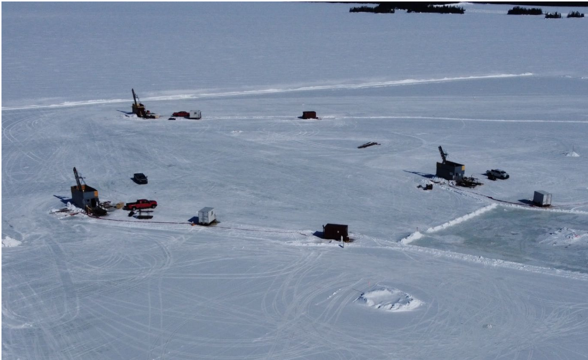
Figure 2: Three drill rigs completing the Golden Eye resource conversion program on the engineered ice pad (March 2026).