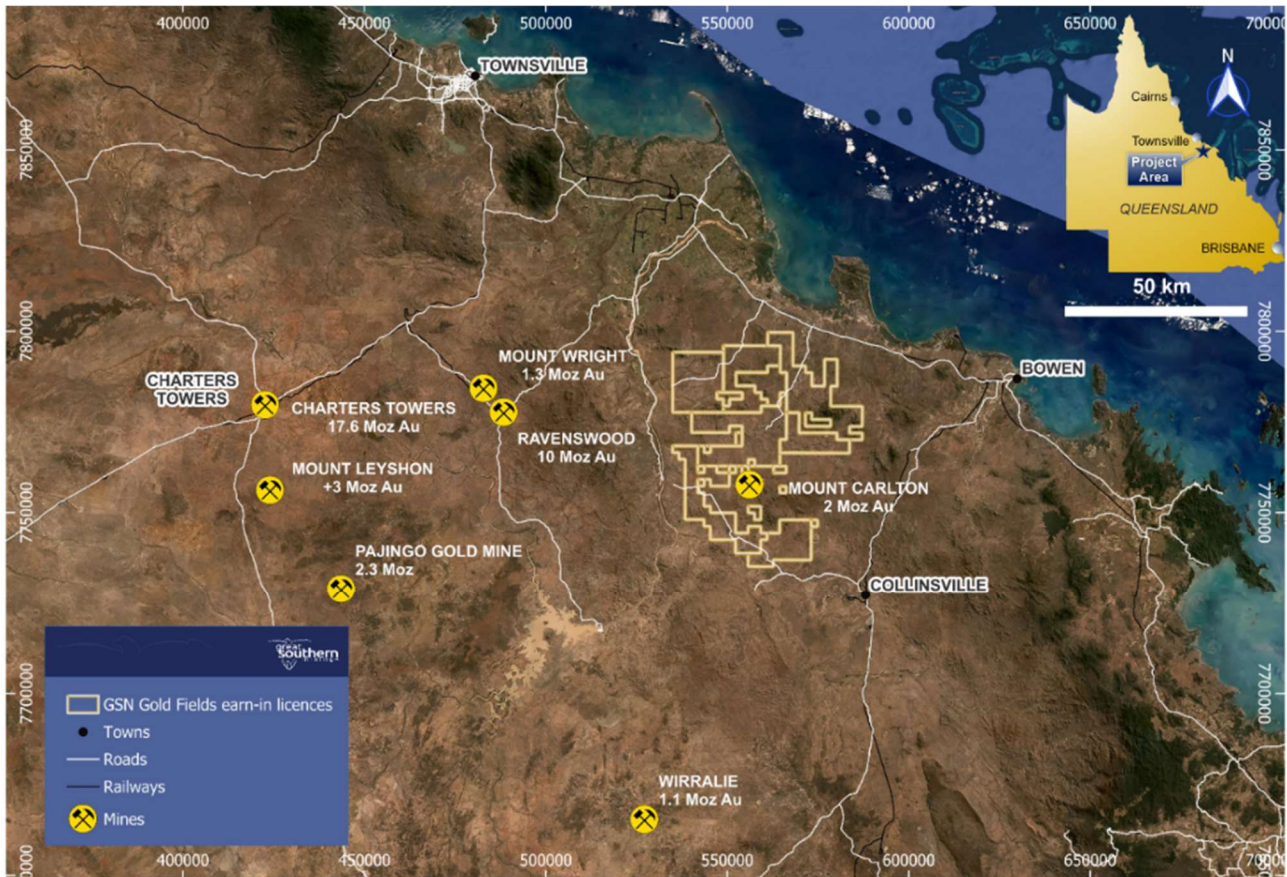
Figure 1. Map of the northern Queensland goldfields showing major deposits and Great Southern Mining's tenure.

Diamond drilling is planned to recommence in May 2026 at the Mt Dillon target. Mt Dillon is considered the highest ranked target defined to date, based on the advanced argillic alteration contained within a preserved lithocap above a significant Induced polarization (IP) chargeability anomaly 3 (Figure 2).