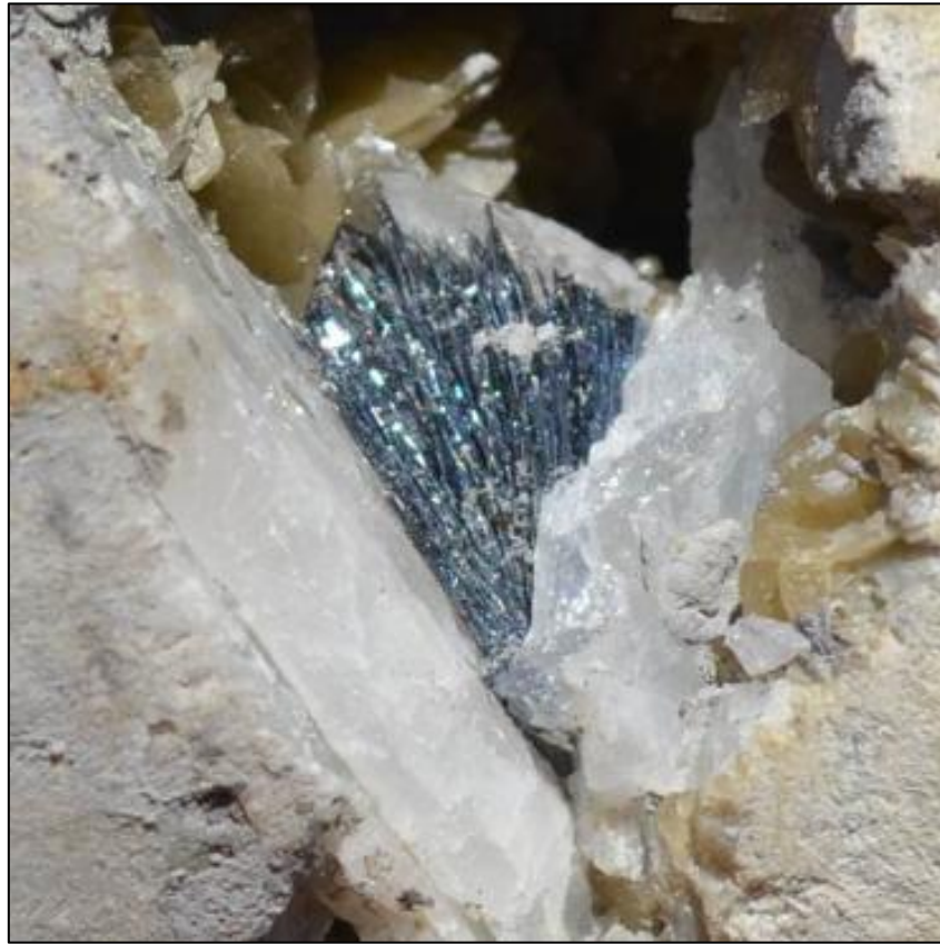
Figure 3: Stibnite (antimony sulphide) needles in fracture in core from BPD08. Antimony containing minerals at Bulla Park are tetrahedrite and stibnite