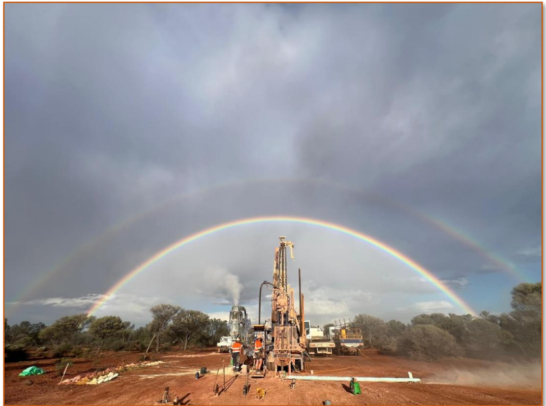
Figure 1 – Drilling at Kookynie South

“Completing these drilling programs at Leonora South is an important milestone for GoldArc. The scale of drilling completed across development, advanced RC and greenfields aircore programs provides us with a substantial dataset to further refine our understanding of the project area. We now look forward to receiving the outstanding assay results, which will guide our next phase of exploration and development and help prioritise follow-up drilling across the Leonora South Project.”