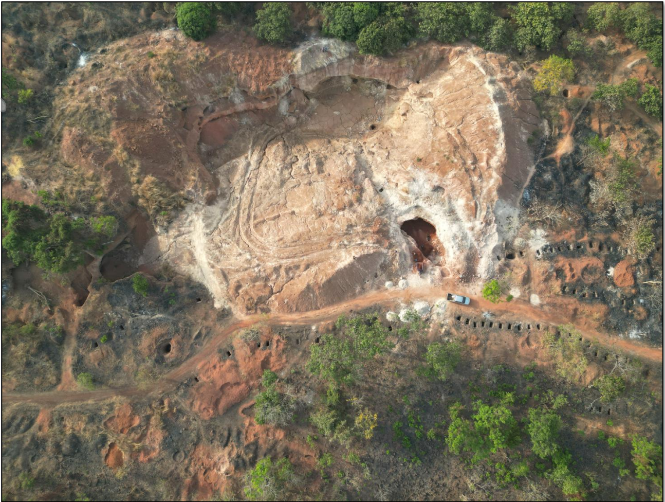
Figure 2 – Artisanal workings identified at Koba, including mechanised mining, over more than 9km.

Across DeSoto's broader south-central project grouping, the Company recommenced exploration with BLEG sampling, soil sampling and power auger drilling. Programs are underway on 11 permits including at the Dadjan and Tolé Projects, following up on the maiden drilling which confirmed a large gold system.