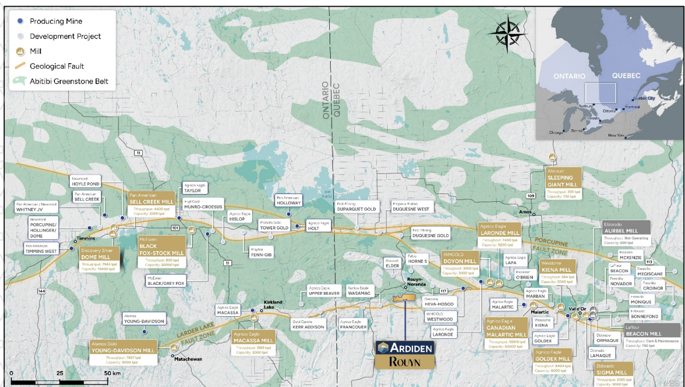
Figure 4 – Major gold mines, processing plants and projects of the Abitibi region

This analogue provides useful geological context in the interpretation of Astoria as a structurally controlled, large-scale orogenic gold system with strong potential for continuity along strike and at depth. While exploration is ongoing and there is no assurance that further work will define a comparable resource, the observed geological similarities are encouraging and support the interpretation of a potentially large and evolving gold system at the Rouyn Gold Project.