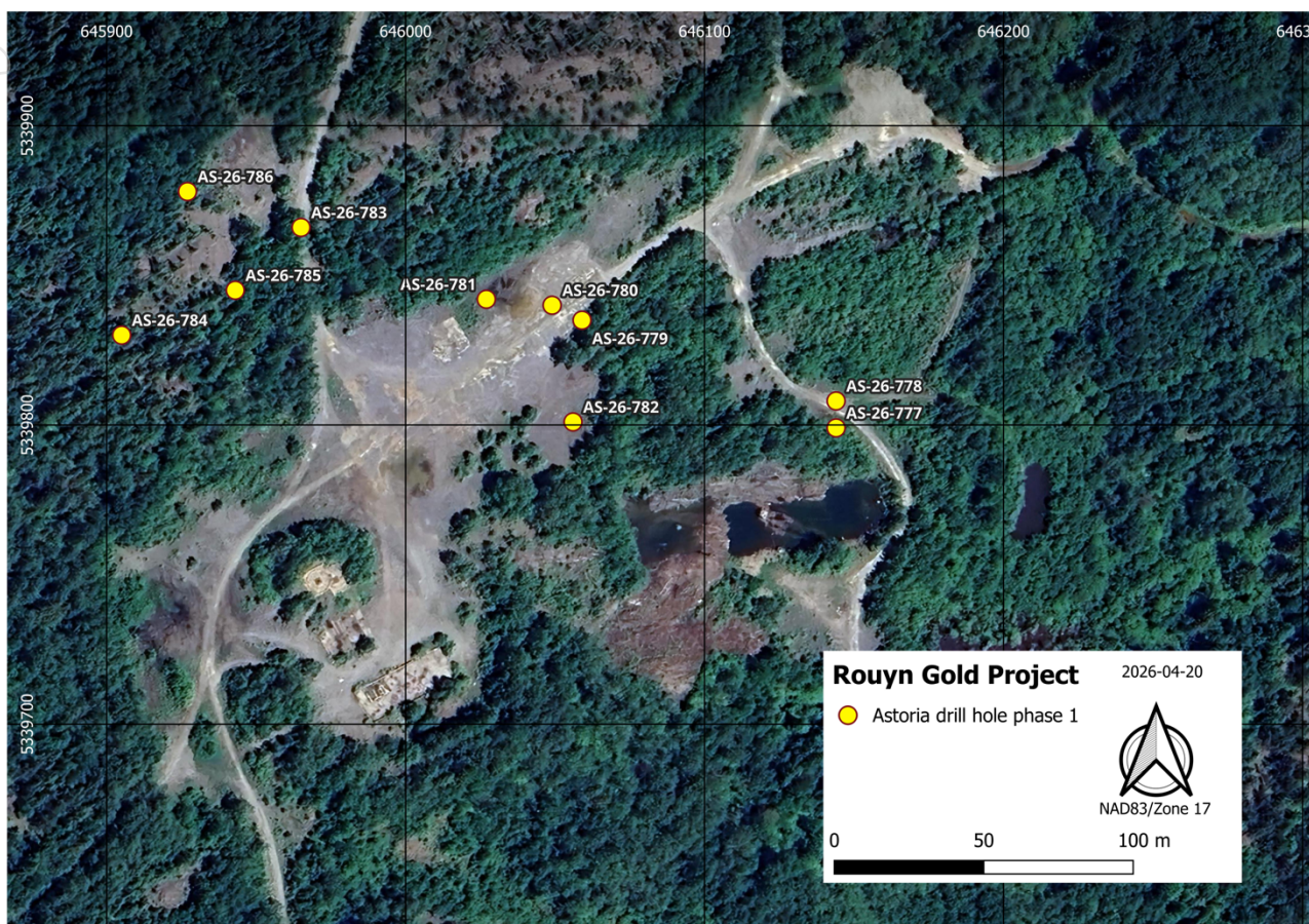
Figure 3 – Drill Hole Collar Locations, Astoria area, Rouyn Gold Project