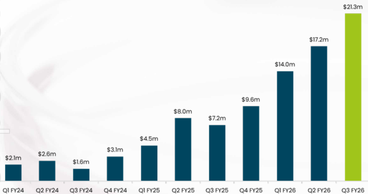
BXN REVENUE BY QUARTER ($m)

Group revenue grew by 24% to a record $21.3 million for the quarter versus the previous quarter. This was attributable to outperformance from BLS Australia, with expanded manufacturing capacity driving growth in white-label and branded products. Early contributions from psychedelics, including MDMA supplies, added to the portfolio, and growing exports to Germany. In addition, the UK and Europe businesses recorded good growth on the previous quarter.