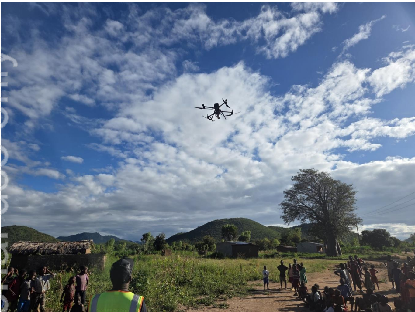
Figure 5- AuKing’s drone being demonstrated to the local community near Nambazu

Approved by the Board of AuKing Mining Limited.