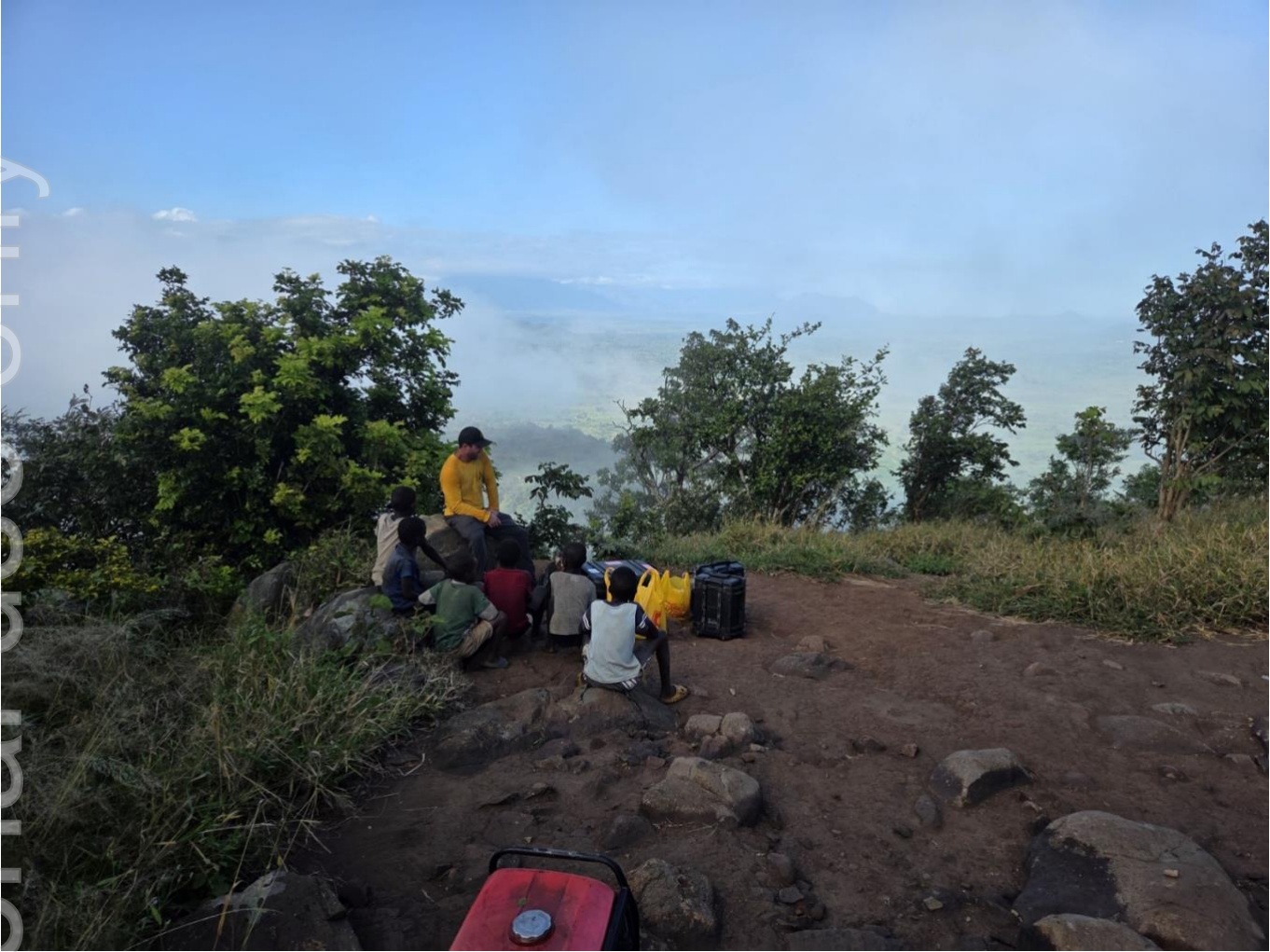
Figure 3 – One of the drone survey staging points