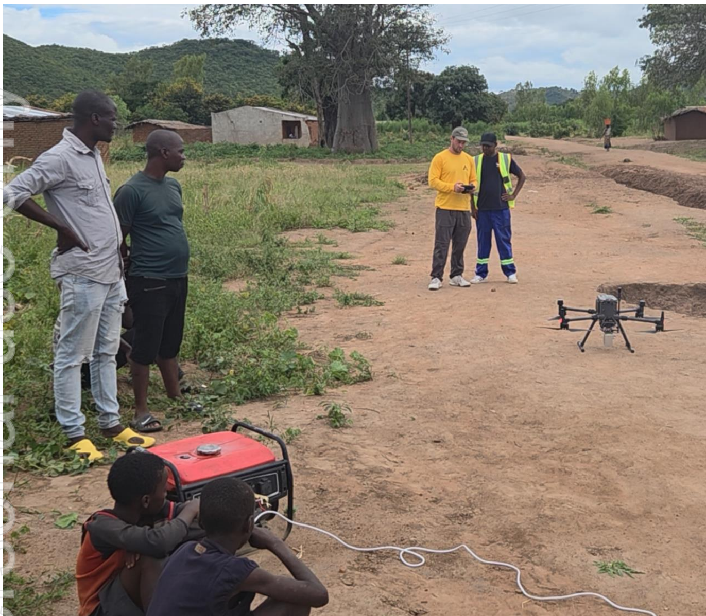
Figure 4 – Getting the drone started