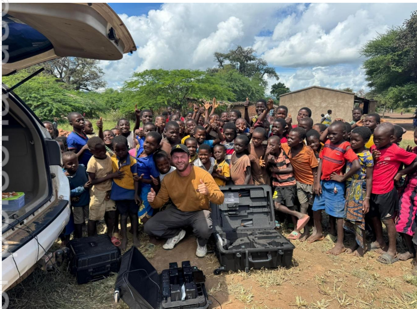
Figure 2 – AuKing unpacking the drone equipment, with friends

AuKing has recognised that a critical aspect of its early activities at Tundulu is the process of significant local community engagement. This process has already started as part of the airborne survey at Tundulu as illustrated by the photo taken with the local township people and children. The planning for proposed drilling at Tundulu will then require an even greater level of local community engagement and consultation.