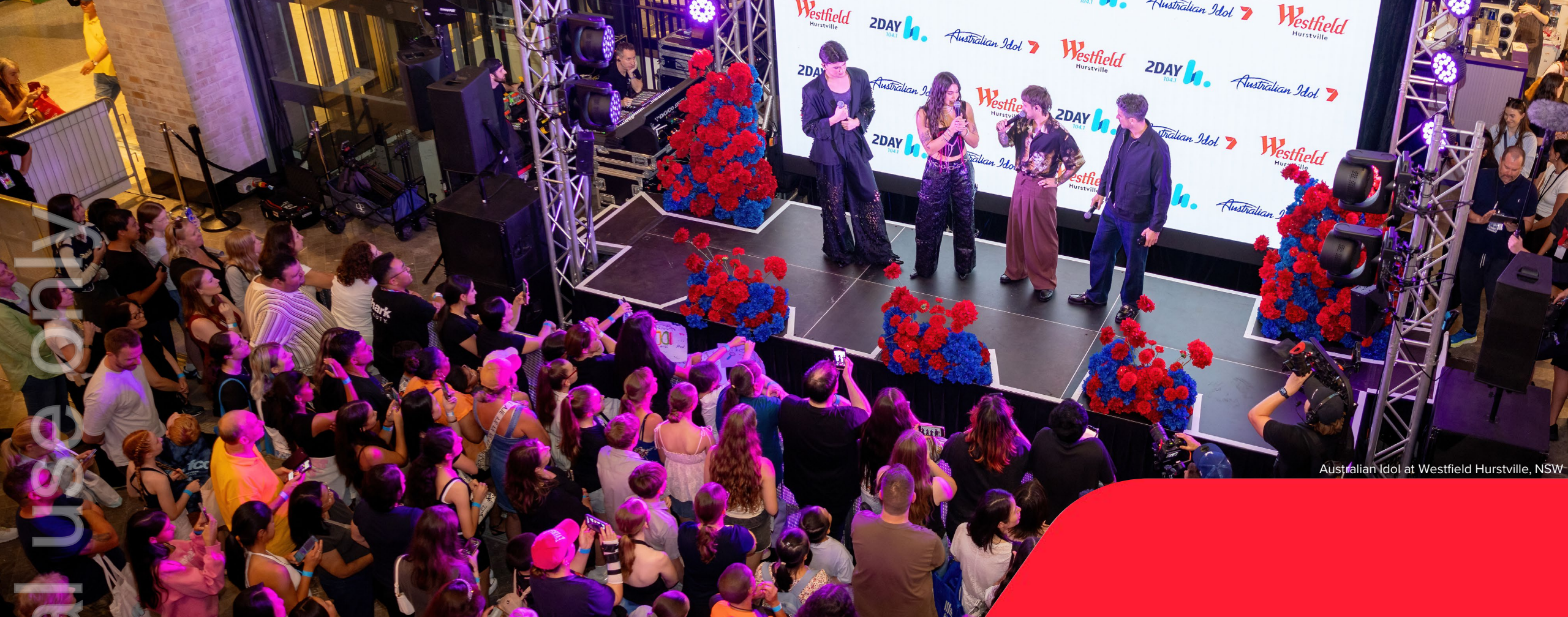
Australian Idol at Westfield Hurstville, NSW