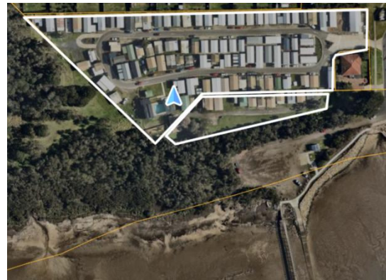
Frenchview Lifestyle Park (1.7ha site)