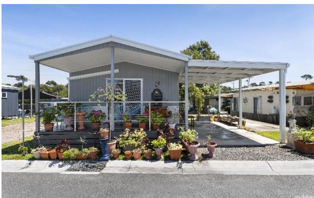
Manufactured Home at Frenchview Lifestyle Village