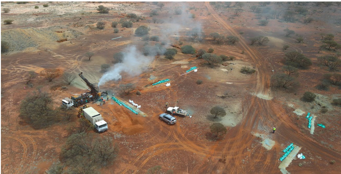
Figure 2: RC drilling at Australia United

Mineralisation remains open both north and south along strike and at depth. Grab samples taken from the old tailings south of the main workings (three samples at 2.4 g/t Au) and from the main spoil heap adjacent to the Fardy's Shaft (four samples at 1.7 g/t Au) all returned positive results, further supporting the prospectivity of the broader Australia United workings.