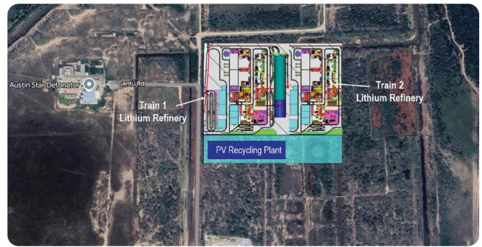
Figure 1. Location of LU7 Proposed Second Lithium Refinery Site with Two Trains and PV Recycling Project Under Evaluation

Watch CFO John Sobolewski’s Video Report from the site visit to assess the suitability of the Port of Brownsville. ( https://www.youtube.com/watch?v=Vu4kJFgmgKQ )