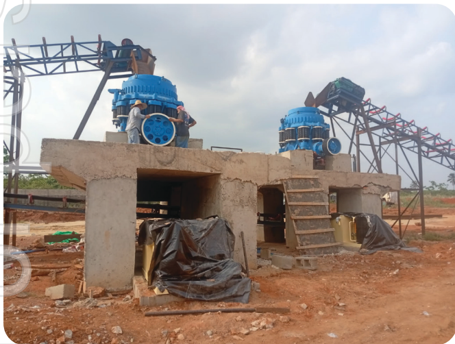
Figure 3. Construction underway on the spodumene concentrator in north-west Nigeria