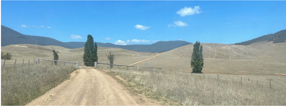
Figure 2: View over Bindi Project tenure EL 7071.

surface mapping potential. Stream sediment sampling is being examined as a cost and time effective method to test for prospectivity within the project tenure.