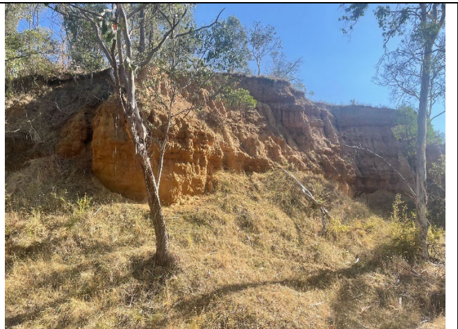
Figure 4: erosion has exposed tailings profile from historical alluvial mining/dredging at Oriental within EL 7073.