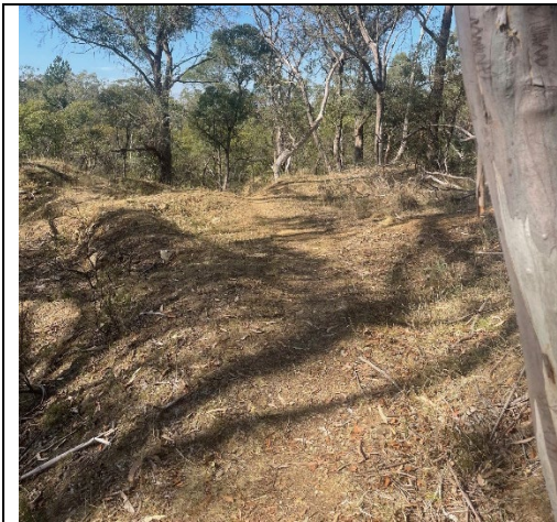
Figure 3: surface landforms highlighting historic alluvial mining.

Rehabilitation of drilling and review of historical alluvial workings (Figure 3,4) was undertaken at Cobungra (EL 7073).