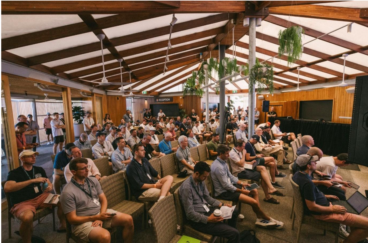
Figure 3. Full house at the Euroz Hartleys Institutional Investor Conference.

Firebird attended the Euroz Hartleys Institutional Investor Conference in March 2026. There was strong interest from institutional investors, reflecting growing market awareness of the manganese-rich cathode technology shift and the strategic value of Firebird's integrated, IP-protected technology platform.