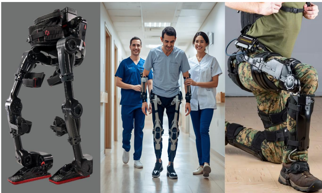
Figure 1: Conceptual Example Images of exoskeletons and their use-cases 3

DVL's sensor heritage is the missing piece. The Company's proprietary wearable motion sensors already capture high-fidelity biomechanical data from the human body. In an exoskeleton context, these sensors become the intelligence layer that tells the system how the wearer is moving, where force is being applied, and when fatigue or injury risk is developing.