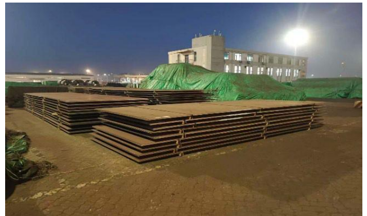
Figure 4: CIL plates at port of Abidjan