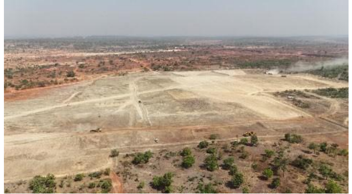
Figure 2: Cleared site - Kobada Gold Project