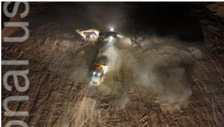
Figure 3: Construction of water storage dam