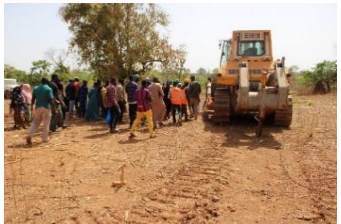
Figure 10 and 11: Groundbreaking Ceremonial