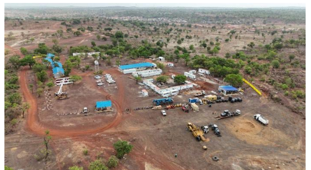
Figure 6: Construction camp