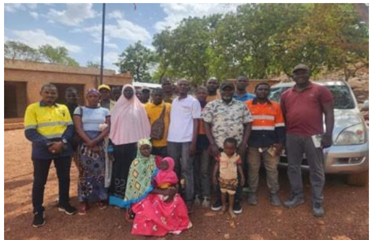
Figure 12 and 13: Various RAP activities and meetings with the local communities