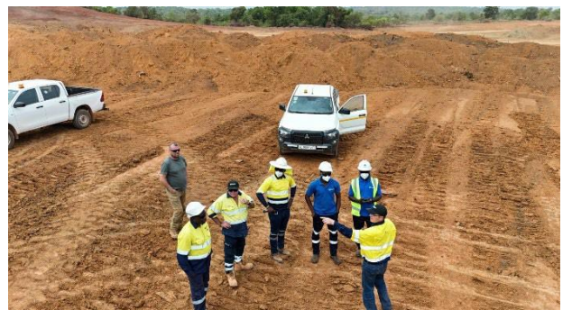
Figure 7: Kobada Project team on site