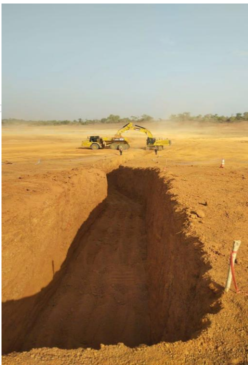
Figure 5: Excavation of embankment of water storage dam