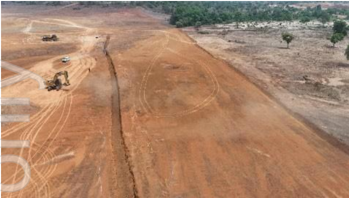
Figure 1: Construction works on the embankment of the water storage dam