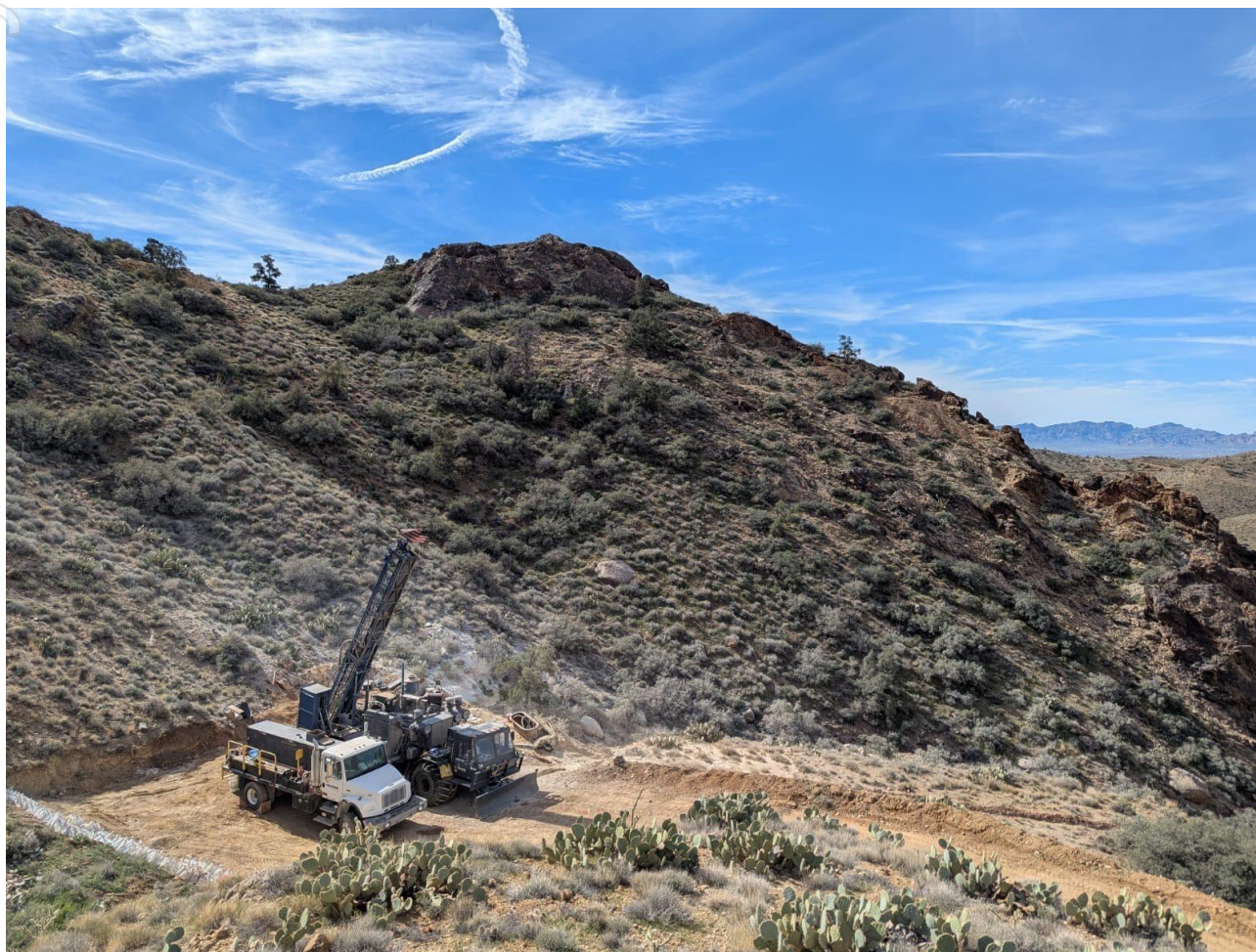
Figure 3. Drill rigs on site at Golconda Project Arizona

Big Sky Drilling mobilised the core rig from Golconda to White Caps in mid-February, with the same rig and crew used to leverage operational efficiencies established during the Golconda drilling program, which operated double shifts. Drilling at White Caps is expected to be completed by June 2026.