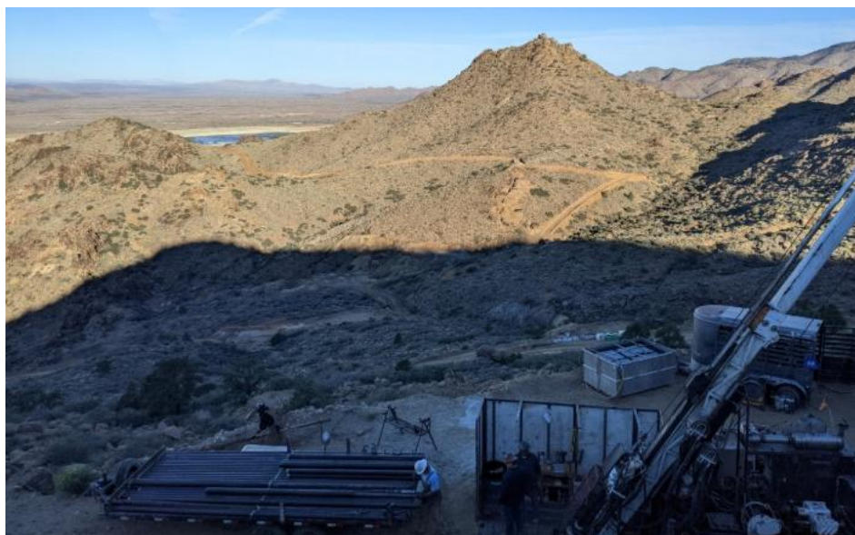
Figure 2. Photo of core drilling in progress at Golconda (November 2025). Mineral Park in background