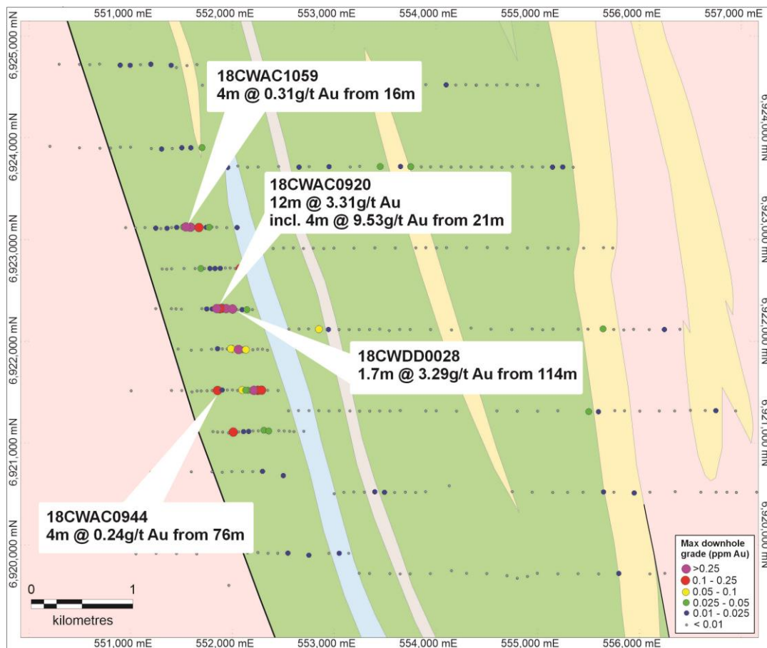
Figure 2: Bloodwood mineralisation identified through very sparse drilling over a 5km strike -representing a compelling exploration target

The Bloodwood Prospect was identified through historical exploration conducted by Gold Road Resources, including air core drilling that defined a coherent gold anomaly extending for approximately 5 km. Limited drilling has returned results including 12m @ 3.3 g/t gold from 20m, with a high-grade interval of 4m @ 9.5 g/t gold from 20m. A diamond drill hole drilled at the Bloodwood target returned 2.95m @ 1.95 g/t gold from 113.45m, including 0.7m @ 4.76 g/t gold from 115m (18CWDD0028). Drilling across the prospect remains limited and the target warrants further systematic follow-up.