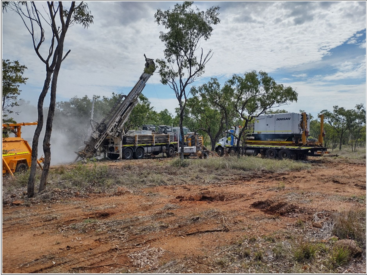
Plate 1. Fiery Creek Drilling, hole 25YFC010