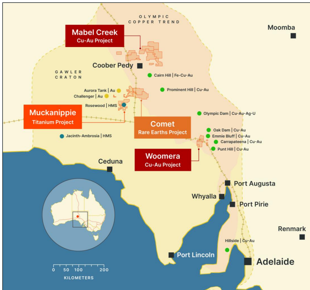
PTR Minerals' Project Locations in South Australia

The Company also has highly prospective copper, gold and rare earth projects. Its Woomera and Mabel Creek copper-gold projects are located in the world-class Olympic Copper-Gold Province of South Australia. Work has uncovered Iron-Oxide Copper-Gold style alteration/mineralisation and geophysical targeting work has identified several compelling Tier-1 Copper-Gold targets which are drill ready. The Company's Comet Project is historically noted for its numerous gold occurrences however early stage greenfields drilling has identified significant Rare Earths hosted in shallow clays over large areas, at 3 Prospect sites.