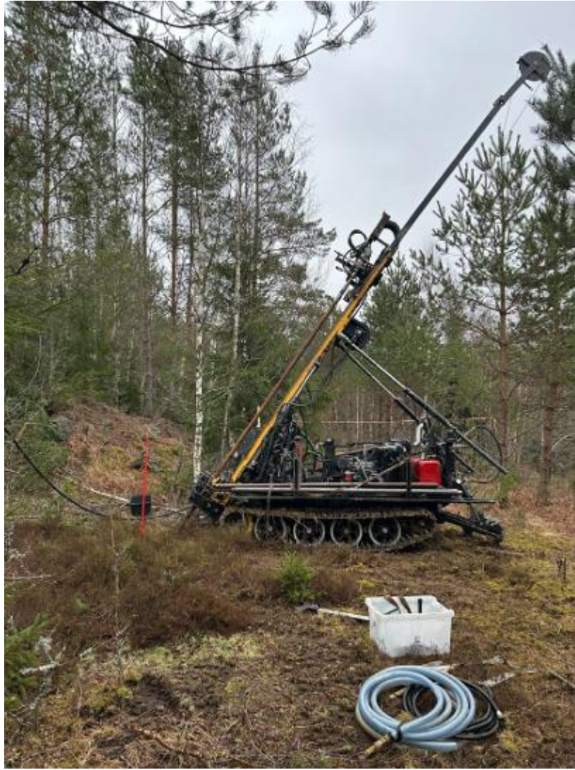
Figure 1: Small footprint diamond drill rig on site ready to commence drilling