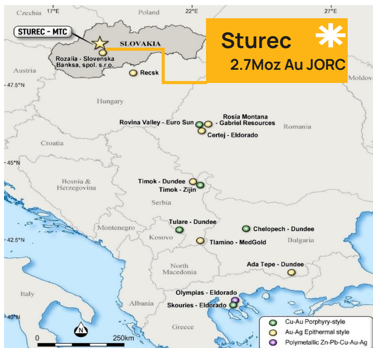
Fig 1: Location map of the Sturec Gold Mine, Slovakia. Refer to ASX Announcement dated 8 May 2023 for complete disclosure regarding the JORC (2012) Mineral Resource Estimate

The Sturec Gold Project is located in the Western Tethyan Gold Belt, which is home to many large gold operations including those owned by Zijin Mining, Dundee Precious Metals and Eldorado Gold.