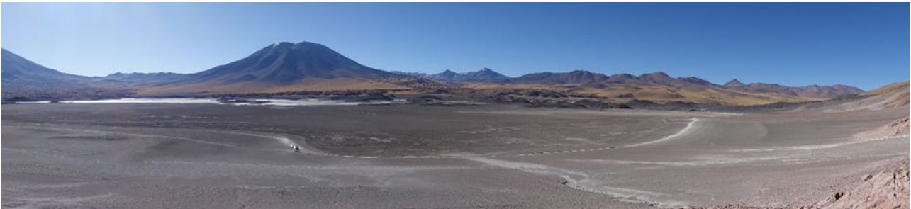
San Jorge Project - San Francisco Salar looking west.

Over the coming quarters, Greenwing intends to advance the scoping study, further refine the potential processing pathway and continue planning for a future drilling program.