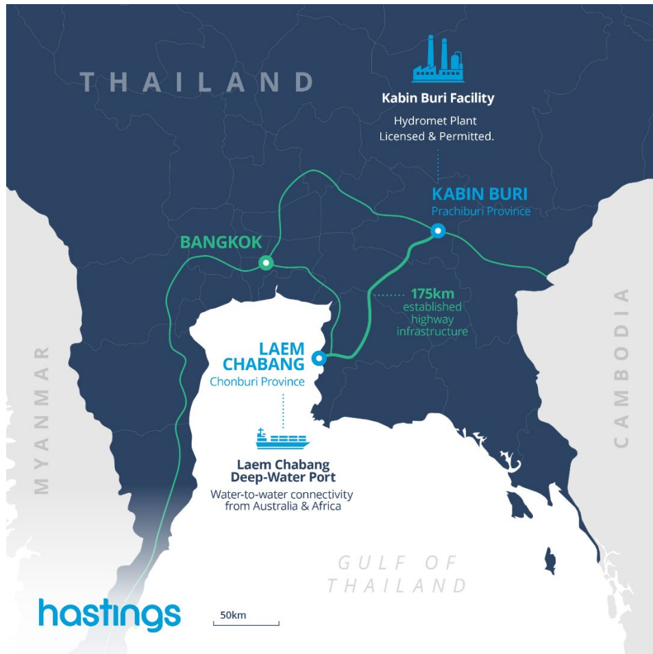
Figure 1: Location of Thai MREC Processing Plant

The signing of a binding term sheet on 31 March 2026 to acquire a 49% interest in the hydrometallurgical MREC plant in Kabin Buri, Thailand, from Enuo Holdings Pte Ltd (“Enuo”) marked a significant strategic development for Hastings during the Quarter. Enuo is a Singapore-based critical minerals group with downstream processing operations in Southeast Asia, Africa, China and Japan.