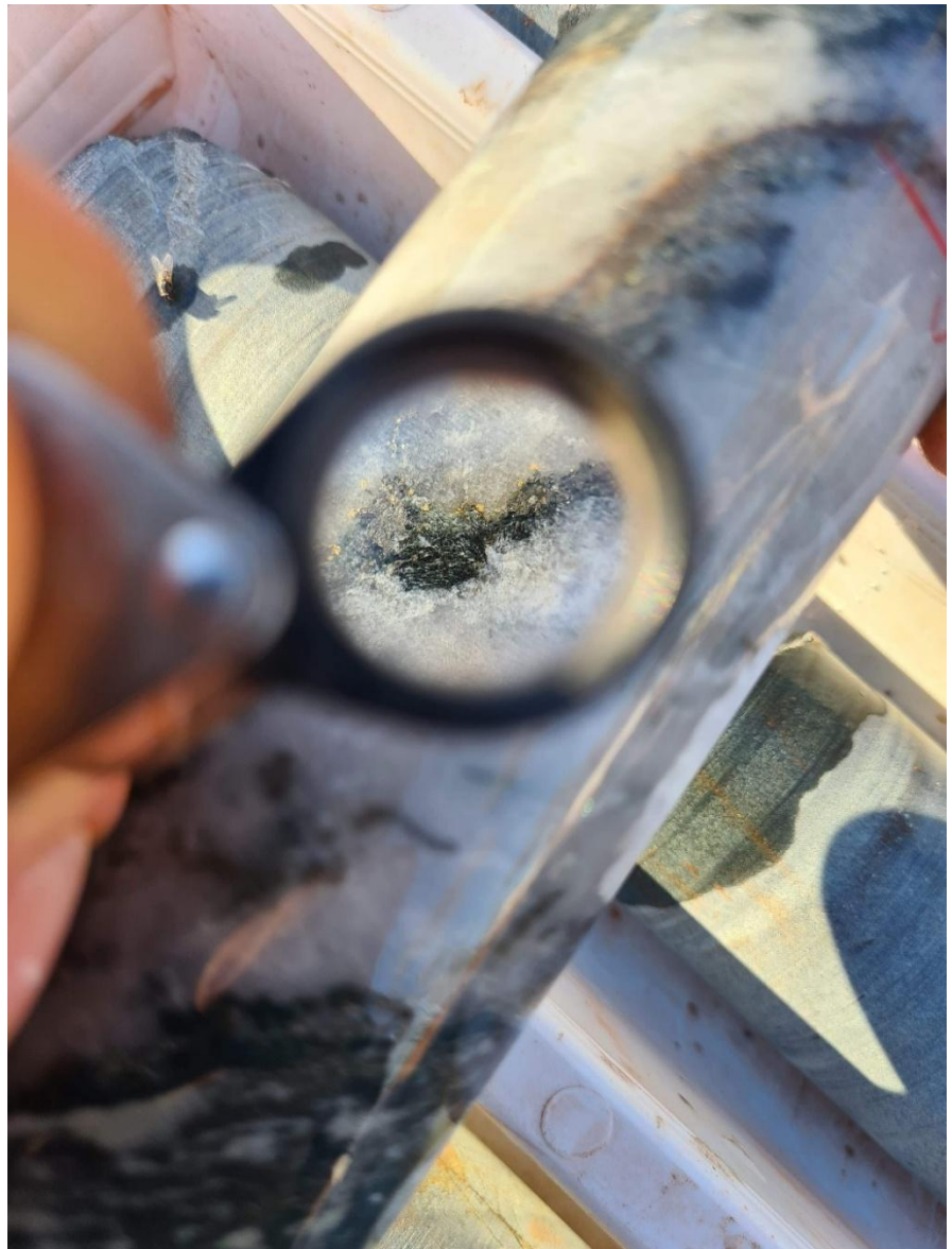
Figure 1: Image of coarse free gold from MZDD001: 76.8-77.0m which assayed 40 g/t Au. Field of view within hand lens ~2.5cm.

These results will be included in the updated Resource in July 2026, which will be followed by completion of a study".