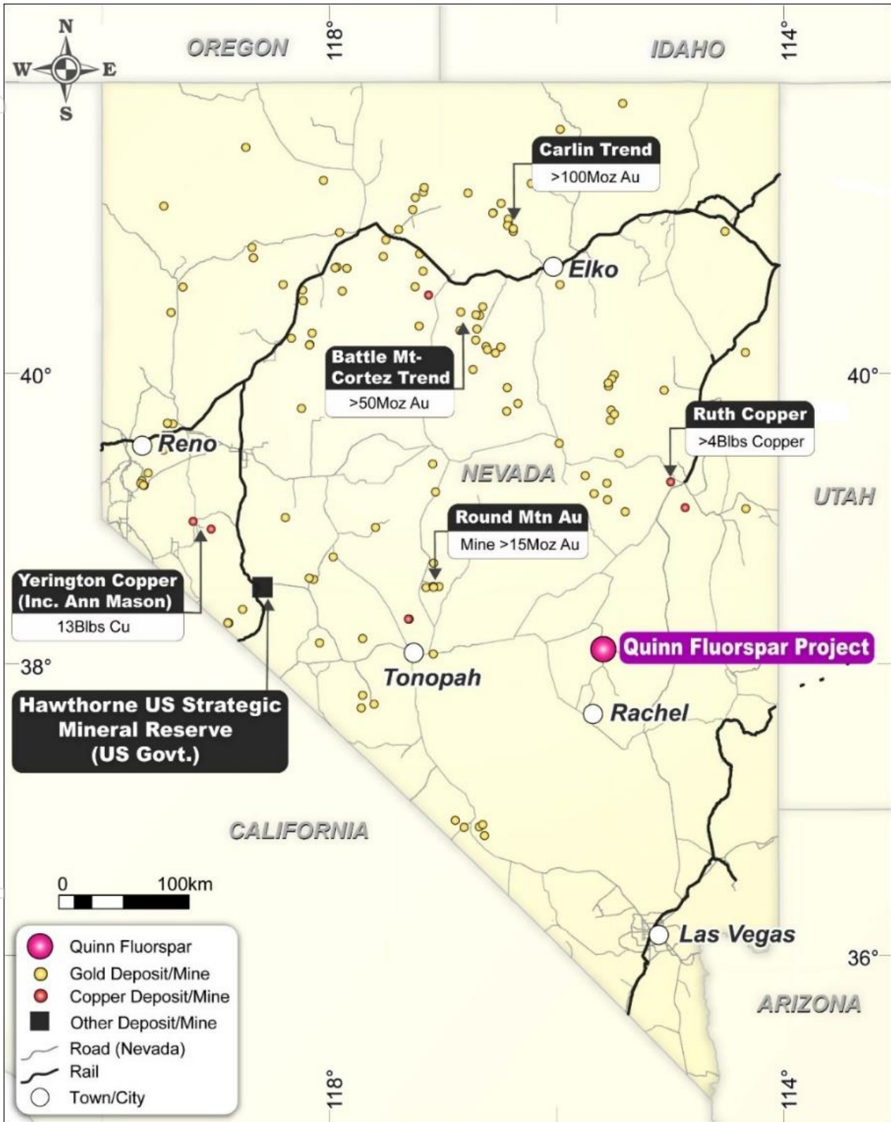
Figure 3 Quinn Fluorspar Location in Nevada.