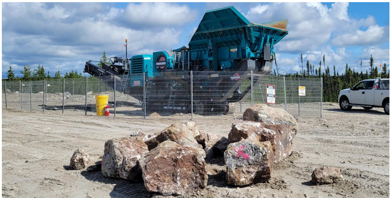
Figure 3: Spodumene pegmatite boulders ready for crusher located proximal to Camp Shaakichiuwaanaan.