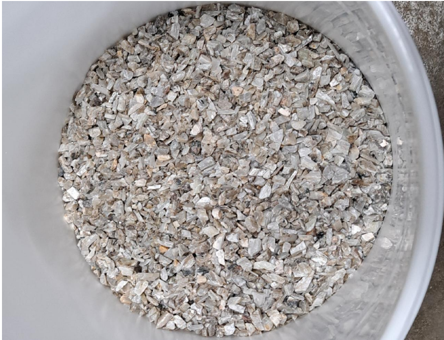
Figure 7: DMS spodumene concentrate (after magnetic separation) assaying 6.32% \text{Li}_2\text{O} and 0.45% \text{Fe}_2\text{O}_3 .