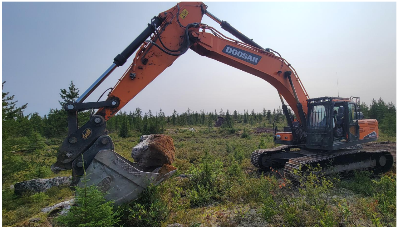
Figure 2: Backhoe collecting spodumene pegmatite mineralized boulders immediately down-ice of the principal CV5 outcrop (adjacent to the southwest side of the CV5 Pegmatite).