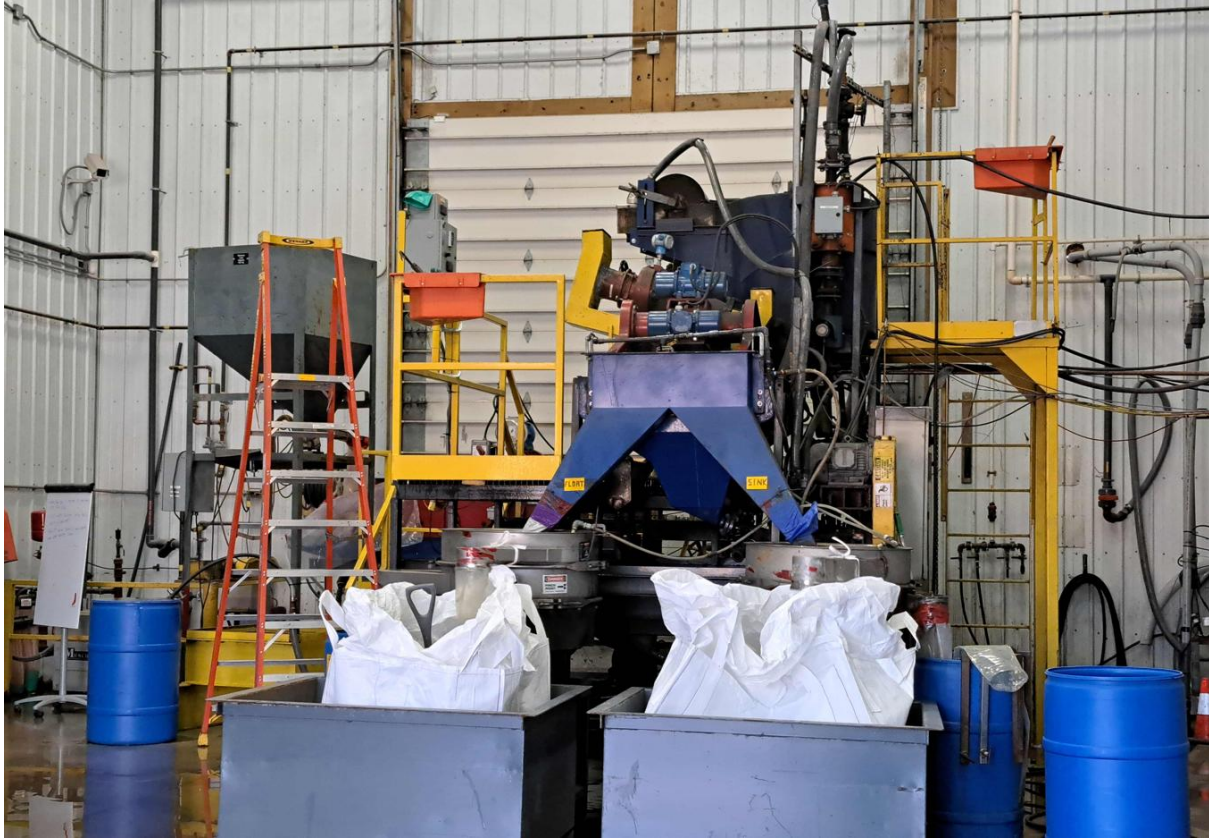
Figure 6: Dense Media Separation (“DMS”) pilot operation at SGS (Lakefield) facility in ON, Canada.