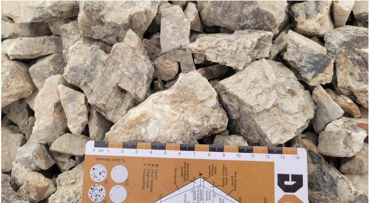
Figure 5: Crushed spodumene pegmatite ready for shipment to the SGS (Lakefield) facility in Ontario for DMS processing with a head-grade assaying 3.61% \text{Li}_2\text{O}