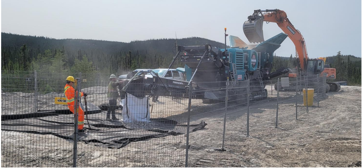
Figure 4: Crushing of spodumene pegmatite boulders into bulk bags.