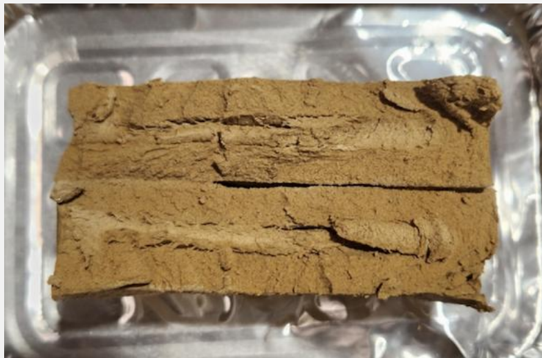
Figure 1. A photo of the successful creation of a dry filter cake from the North Stanmore flotation concentrate.

Clay Filtration and Tailings Management Clay hosted projects commonly present challenges with filtration and tailings disposal. Testwork to date on North Stanmore material has produced excellent results, with the clay residue proving to be highly amenable to filtration and dry stacking. This will allow for a more cost-effective tailings storage solution with lower CAPEX requirements compared to traditional wet tailings storage methods.