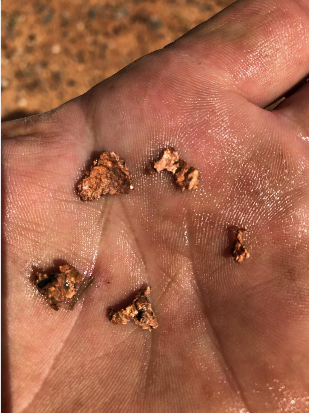
Photo 1. Cu nuggets from YRC26-26 (85m to 86m)

Phone: +61 (0)8 6389 1032 www.resourceempire.com.au