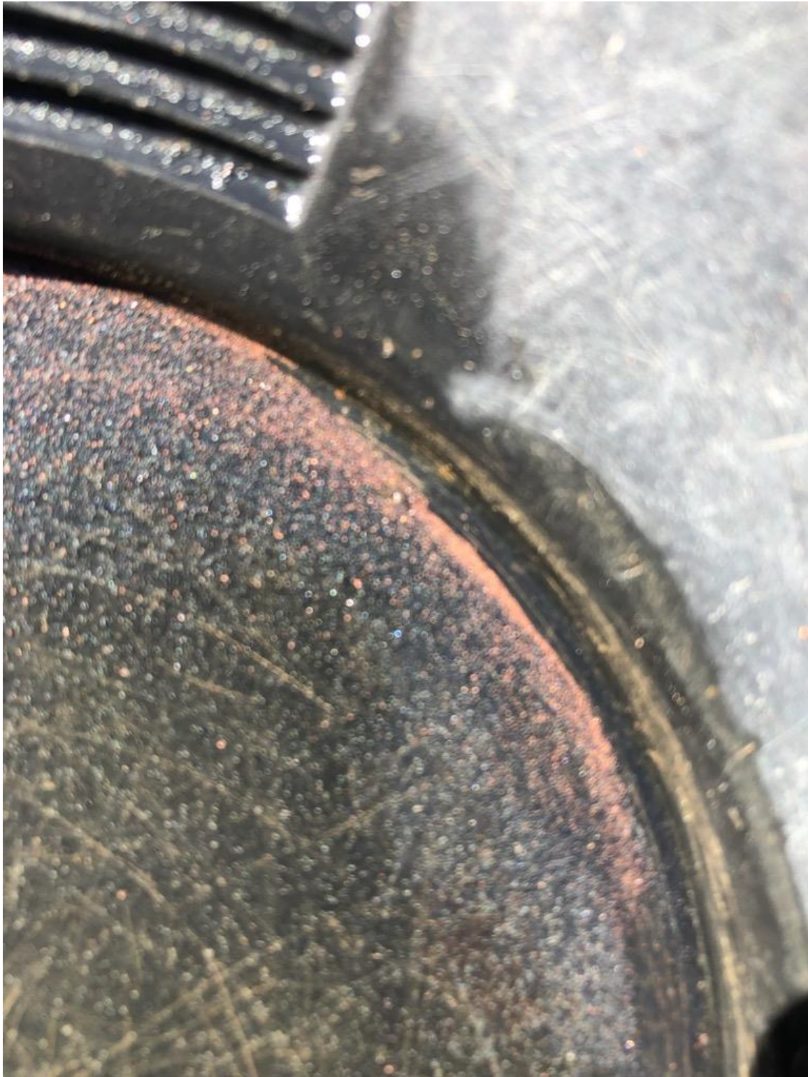
Photo 2. Panned tail showing native copper (pink colour) from drill chips from YRC26-23 (97m to 98m)