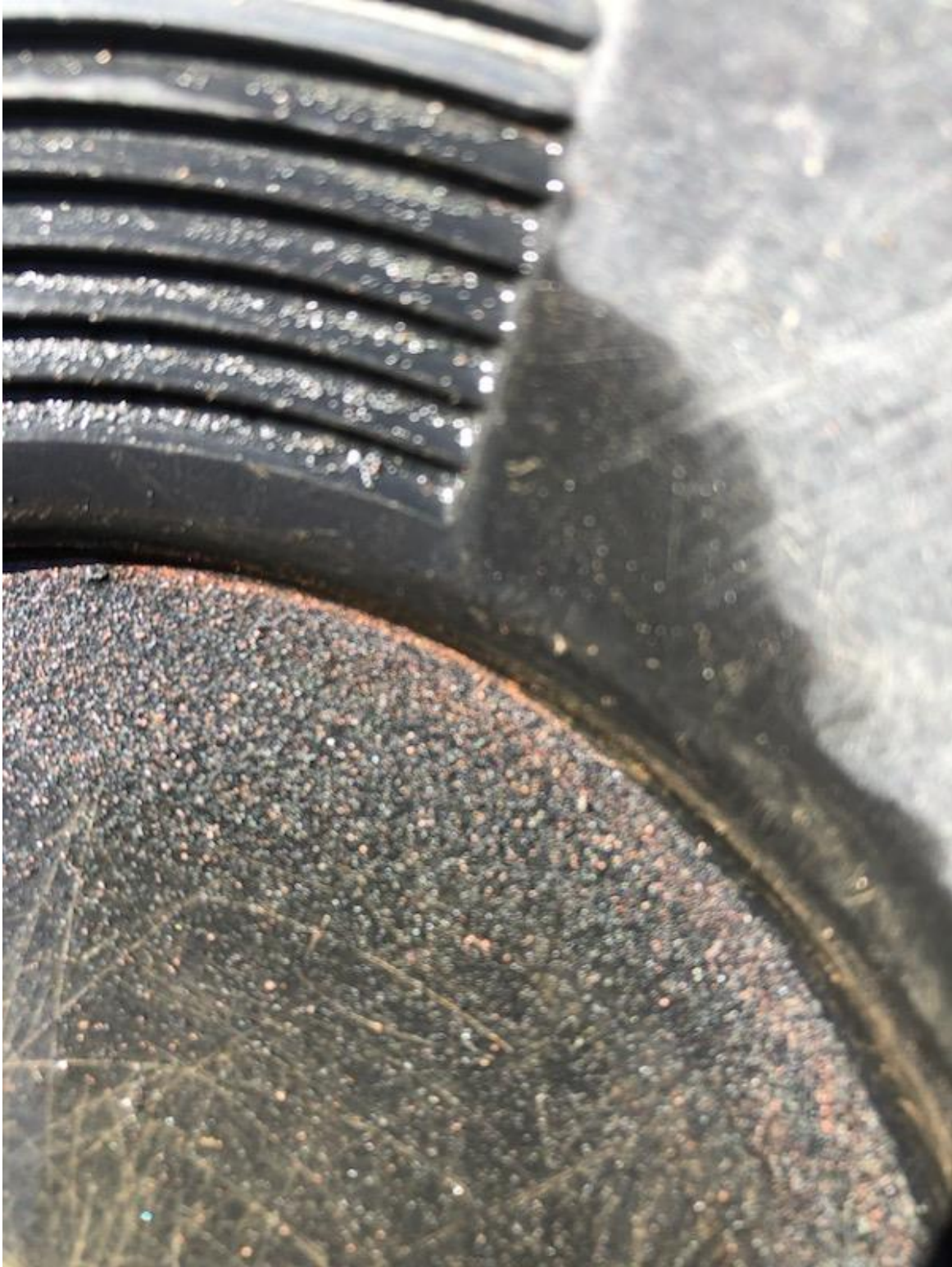
Photo 3. Panned tail showing native copper (pink colour) from drill chips from YRC26-24 (135m to 136m)