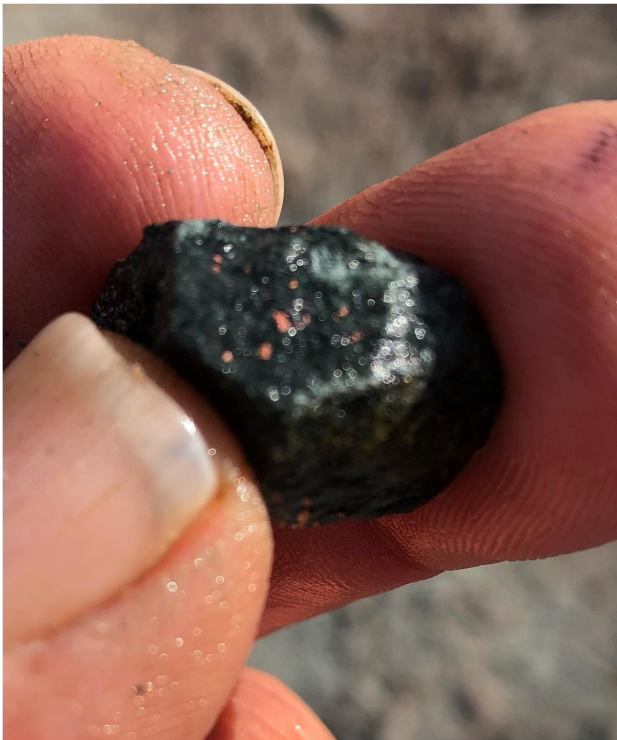
Photo 4. Speckly native copper from YRC26-20 (89m to 90m)