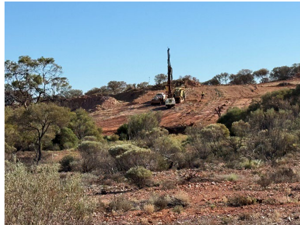
Image 2: Drilling at Redcastle Gold Project including blast holes for mining

Provided that mobilisation there are no unforeseen circumstances, the Company anticipates continuous mining operations will be underway by late May.