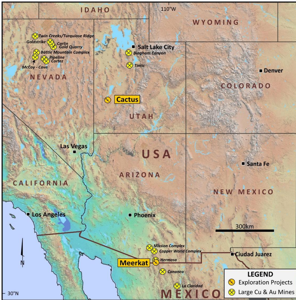
Figure 1: Hawk Resources project locations in Utah, USA.