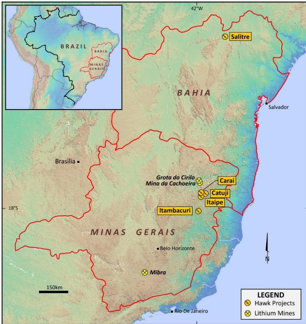
Figure 3: Hawk Resources project locations in Minas Gerais and Bahia, Brazil.