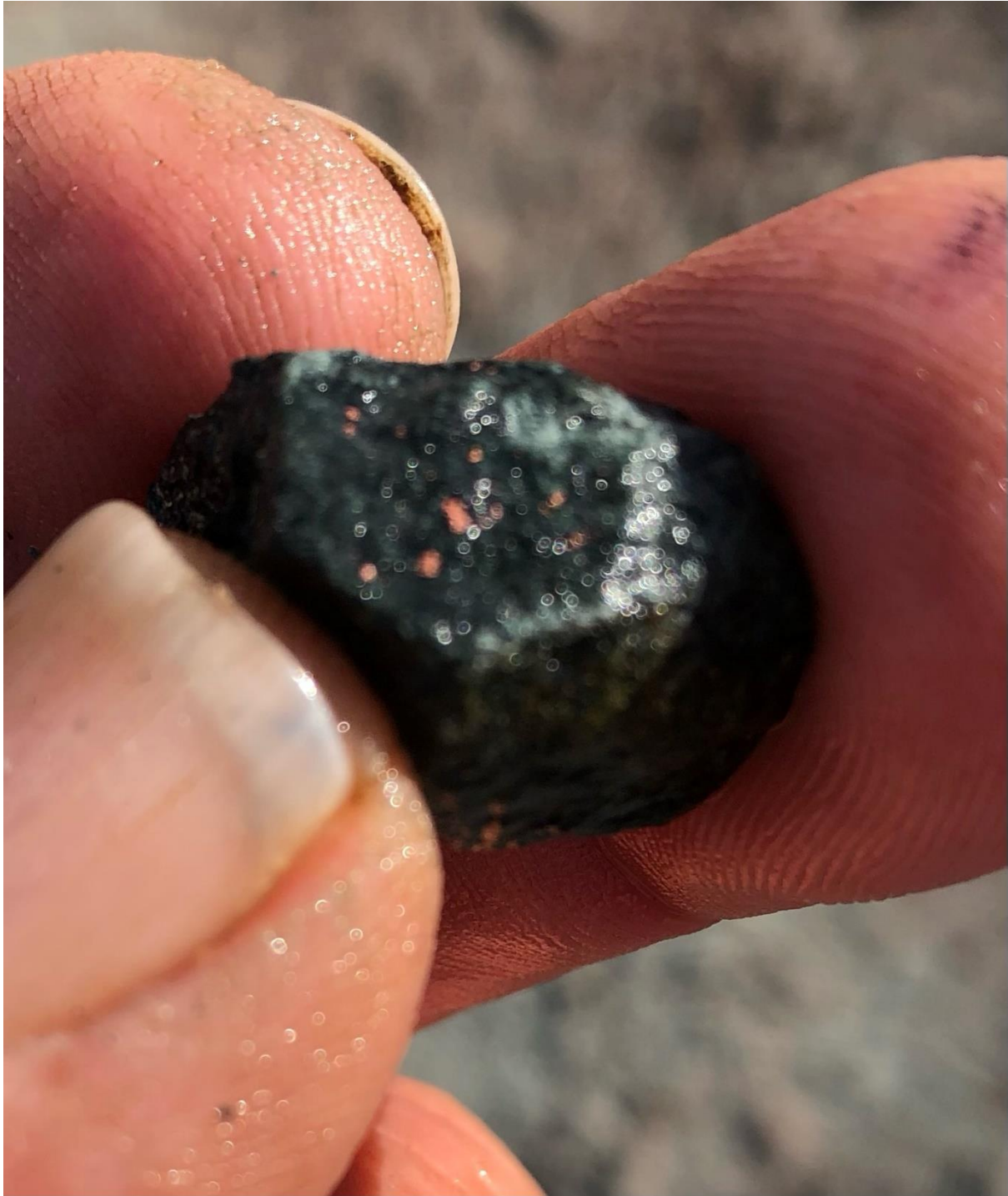
Photo 4. Traces of speckly native copper on rock ship surface from YRC26-20 (89m to 90m)