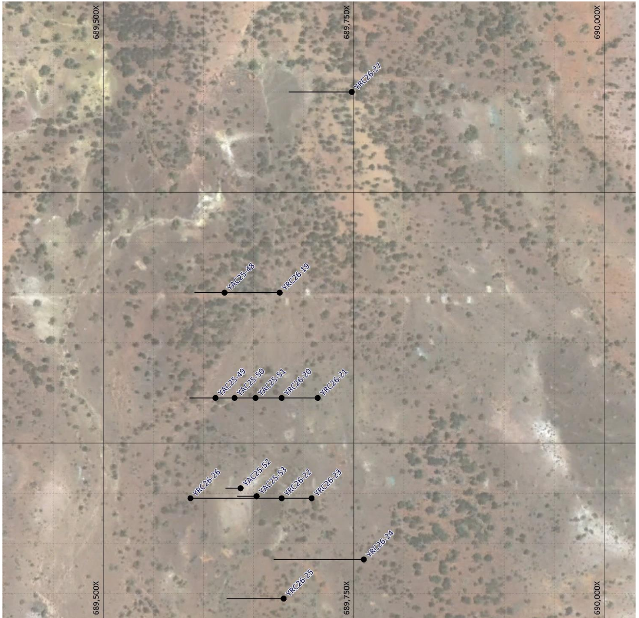
Figure 1. Collar locations of Hillside drilling from 2025-2026