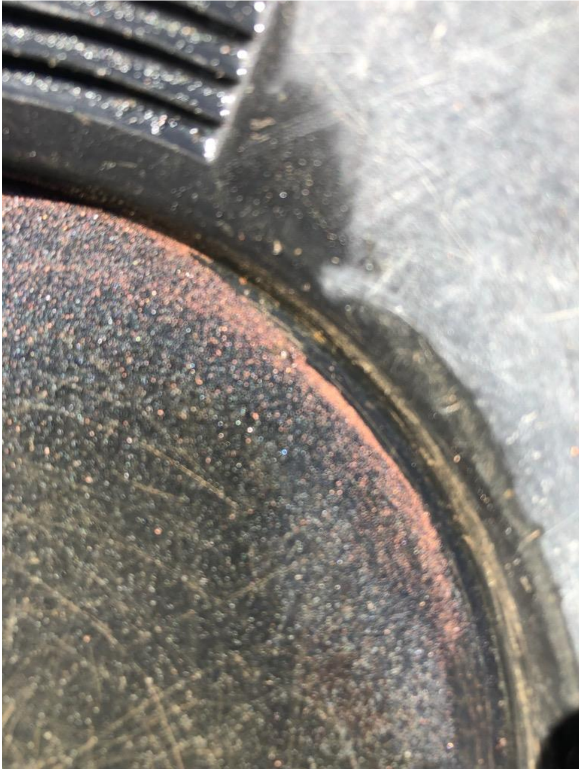
Photo 2. Panned tail showing native copper (pink colour) from drill chips from YRC26-23 (97m to 98m)