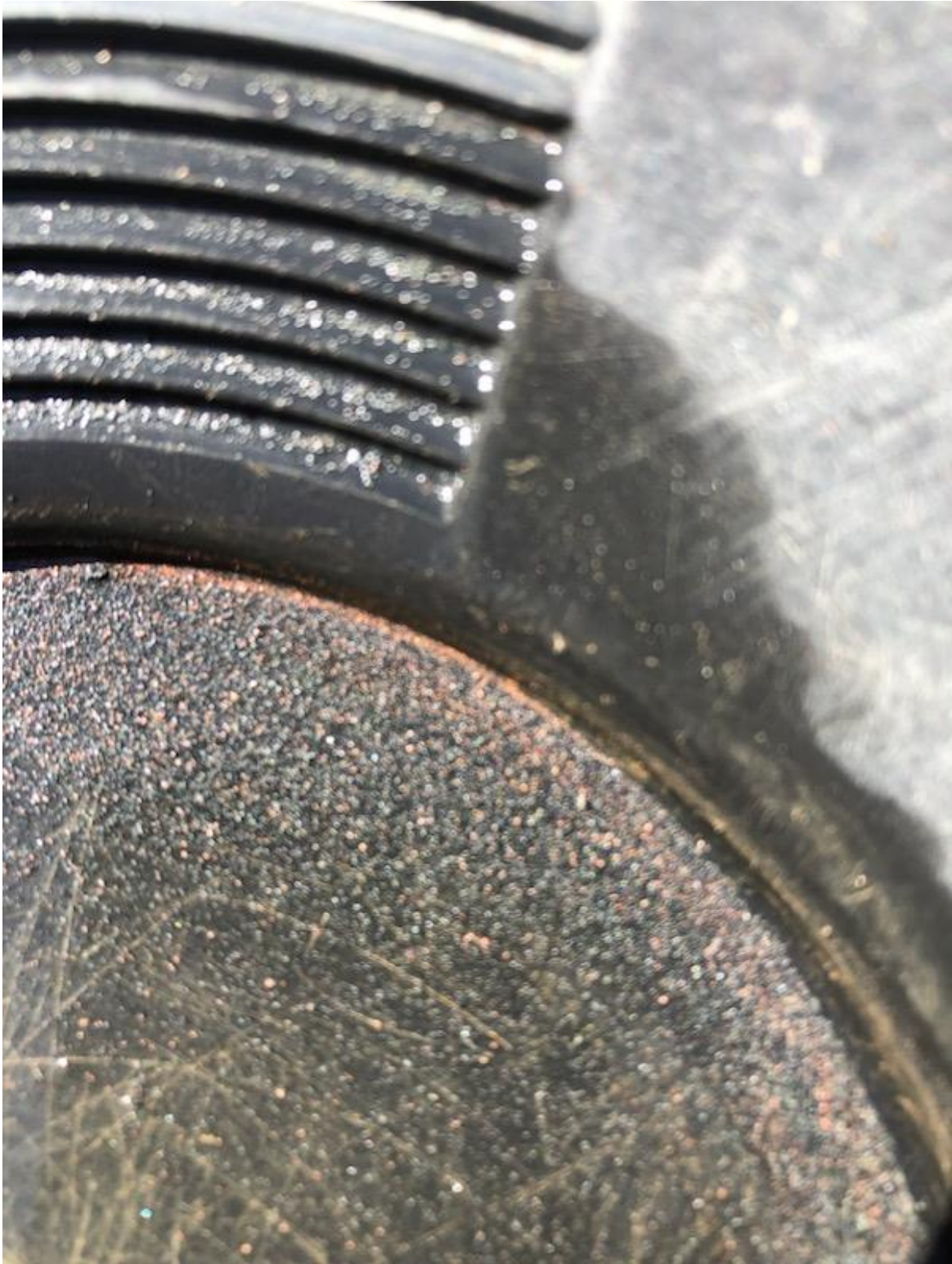
Photo 3. Panned tail showing native copper (pink colour) from drill chips from YRC26-24 (135m to 136m)