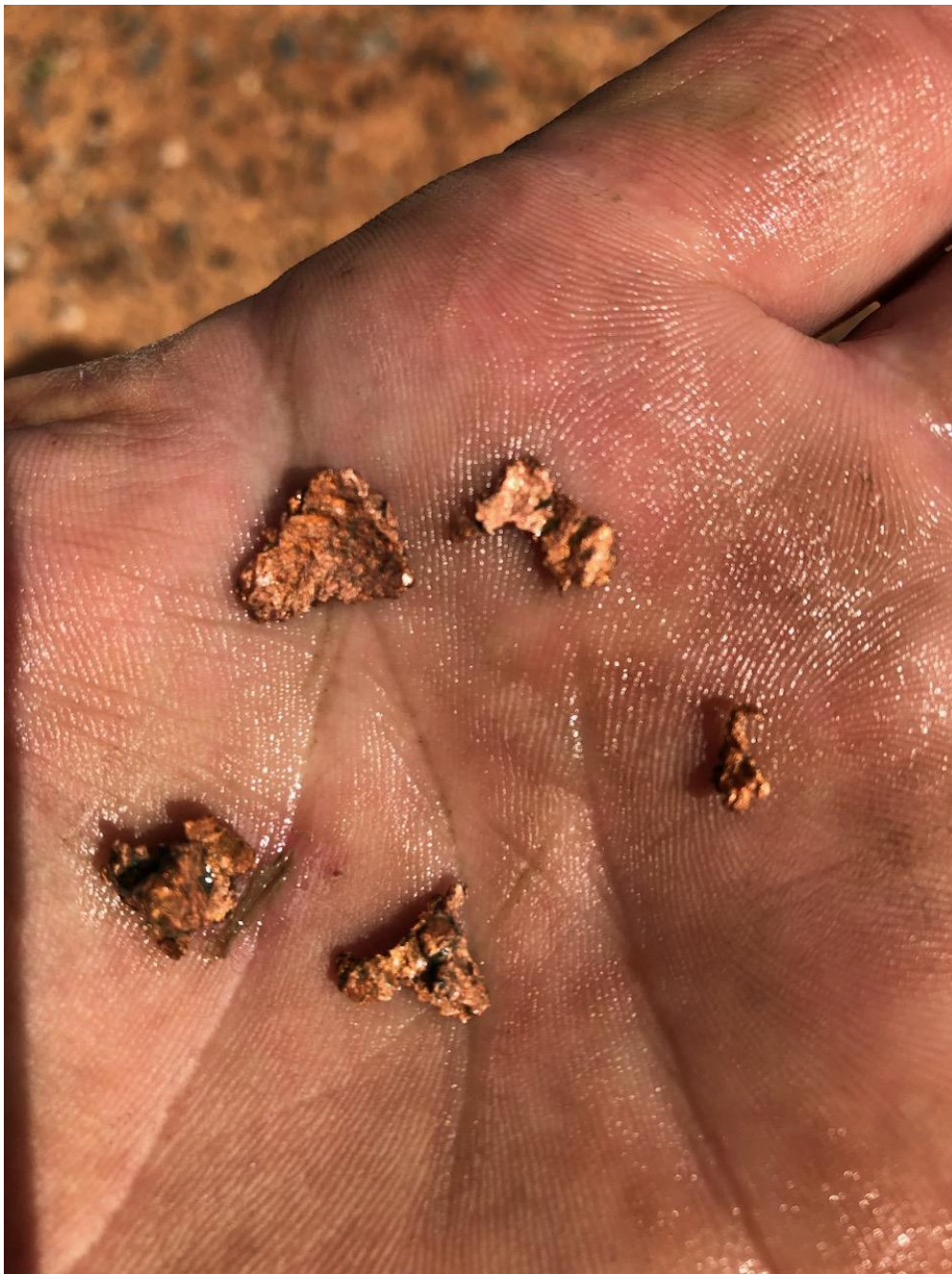
Photo 1. Selected Cu nuggets from YRC26-26 (85m to 86m)