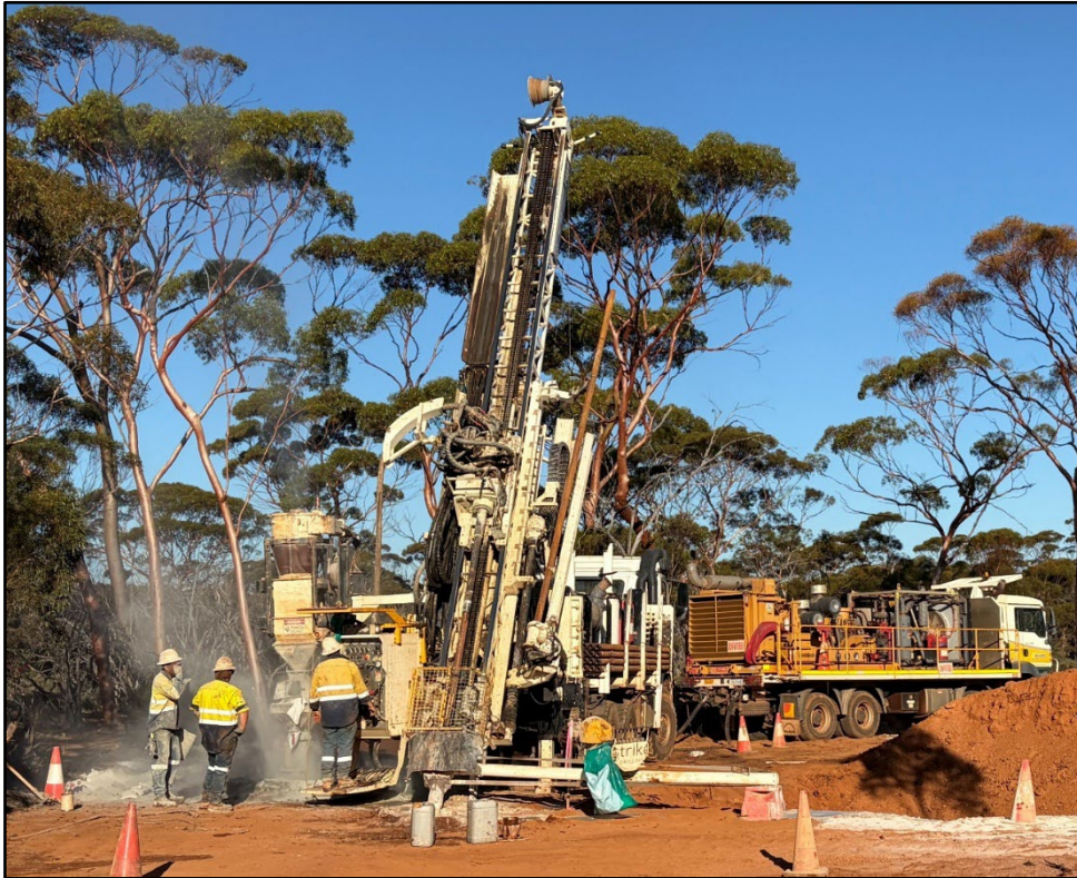
Figure 1. RC drilling at Beaker 2