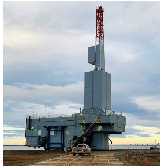
Figure 1: Nordic-Calista Rig-3.

This prior experience, combined with Nordic's competitive pricing, which included a commitment fee of US$395,000 and a minimum of 30 days at the base operating rate, informed the decision to select Rig 3 for the Augusta-1 programme, materially reducing execution risk as 88 Energy progresses toward drilling.