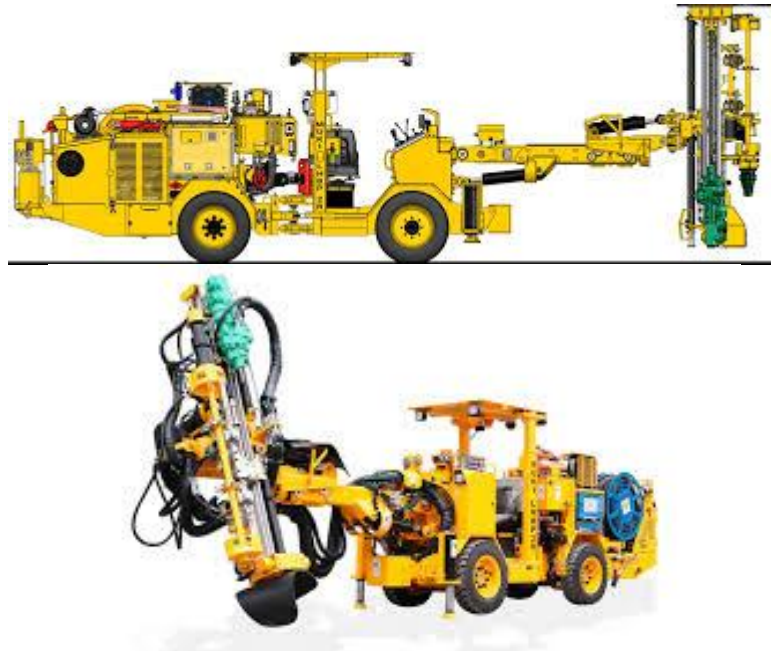
Figure 2 Muki Production Drilling Rig