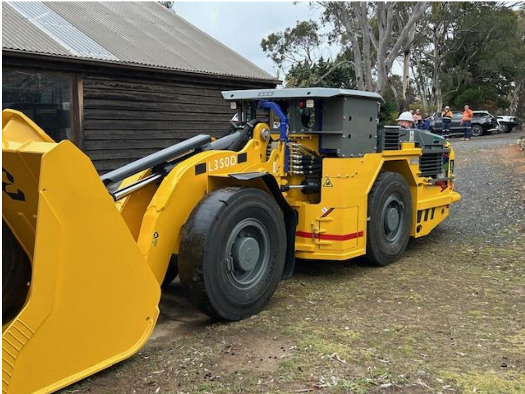
Figure 3 Second Aramine Loader arrival on site