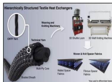
Fig. 3 Hierarchically structured textile heat exchangers — CNTF yarn to woven & knit spacer fabrics.

Pure is executing a downstream strategy anchored by a funded R&D collaboration with Rice University , focused on Carbon Nanotube Fibre thermal management technology for AI data centre infrastructure and defence applications.