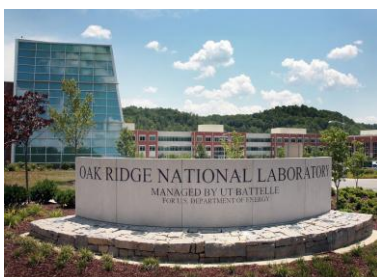
Fig. 2 US DoE Oak Ridge National Laboratory — HREE & Yttrium recovery programme.

The deposit has attracted a Strategic Partnership Projects Agreement with the US Department of Energy (DoE) Oak Ridge National Laboratory , targeting the recovery of Heavy Rare Earth Elements and Yttrium for United States critical materials supply chains.