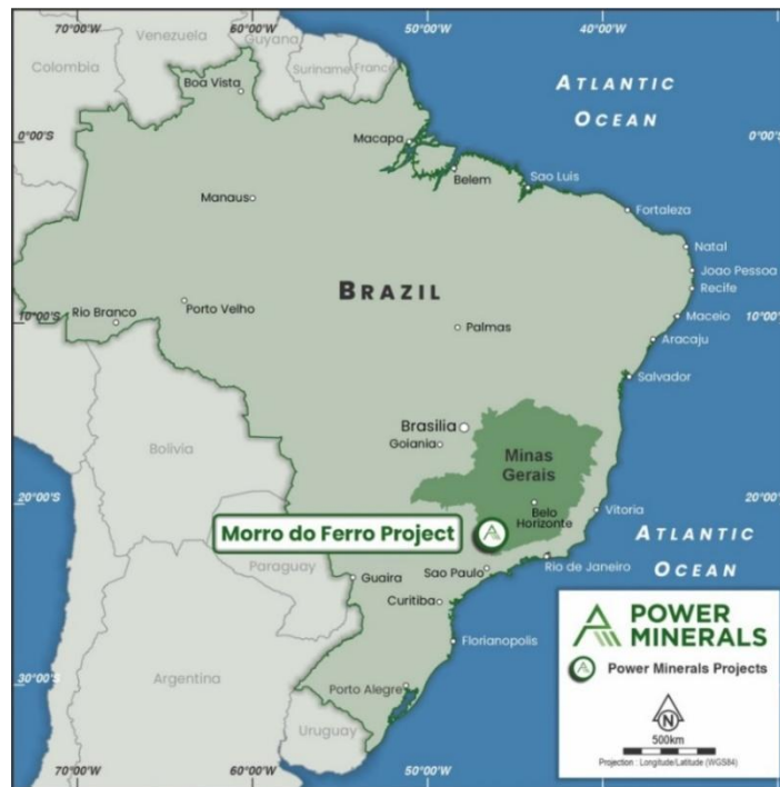
Figure 2: MDF Project location map in Minas Gerais State