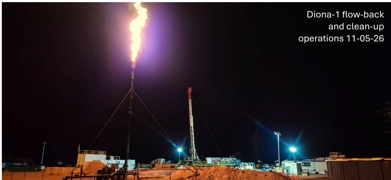
Diona-1 flow-back and clean-up operations 11-05-26

The Diona-1 exploration well has been successfully stimulated across its identified Permian net gas pay and completed with 2-3/8" tubing with sliding sleeve completions. The workover rig and ancillary equipment is being demobilised from site and the well testing package has been rigged up. The well was opened late on Sunday afternoon (10 May 2026) and Diona-1 commenced free flowing its completion and stimulation fluids back to surface. Currently the