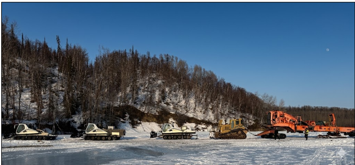
Figure 3. Snow road operations showing three snowcats and a D7 bulldozer linked together, combining 1,825 horsepower about to haul the screen plant up the steepest trail section