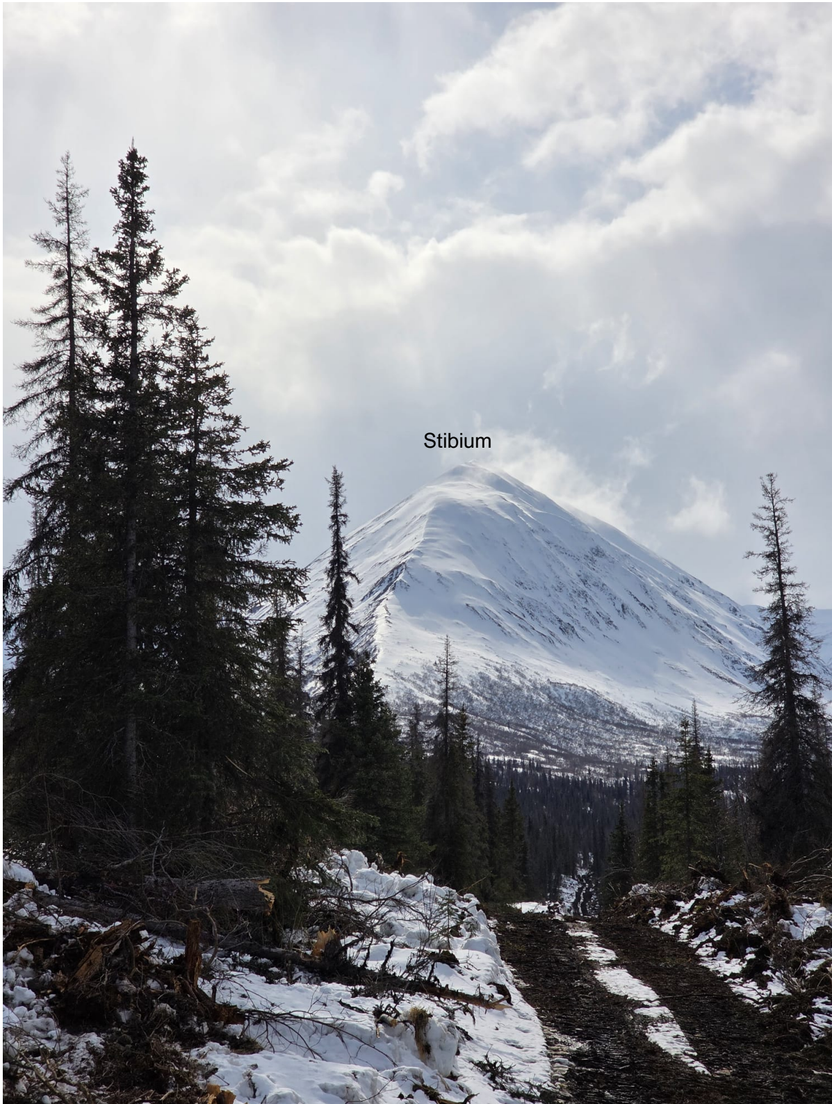
Figure 4. Construction of the Stibium access trail with the Stibium antimony-gold prospect visible in the background.