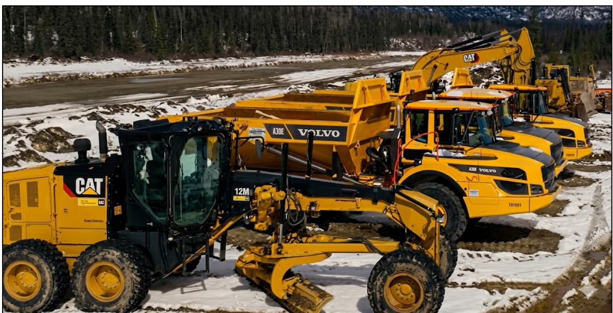
Figure 2. Mining and processing equipment at the Estelle base camp site