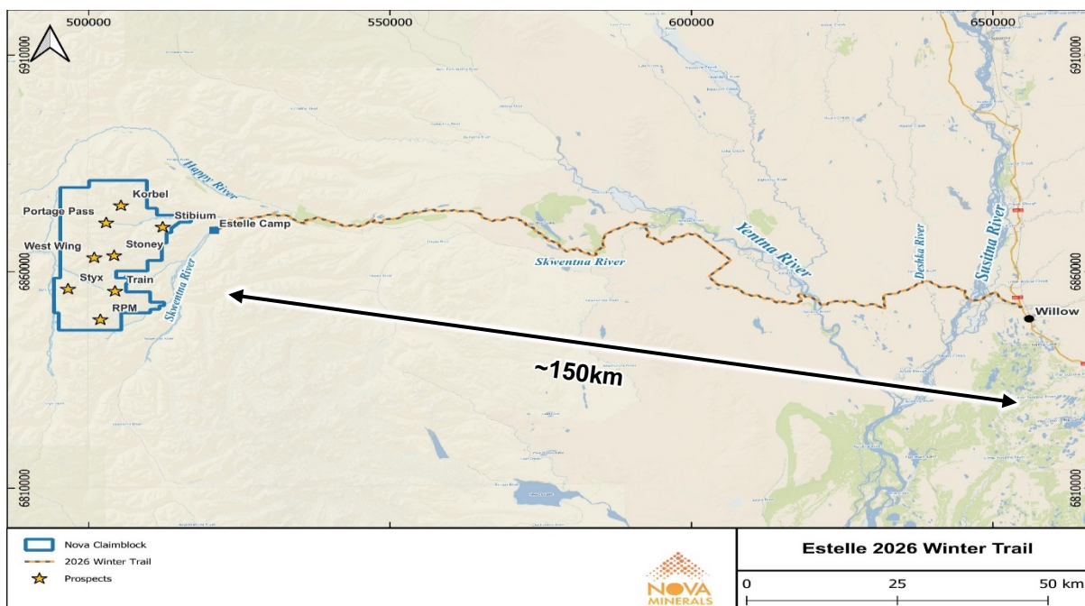
Figure 1. Map route of Nova’s 2026 winter snow road

“We are extremely proud of the entire team - from the procurement folks in town to the operators on the trail and our personnel at camp - everyone came together to deliver the largest freight season ever seen this end of the Skwentna River. With our fleet of equipment on site this project is now complete and we are ready to start three new ones: constructing a trail to Stibium, expanding the existing airstrip, and building an ore sorting and onsite processing plant at camp. Combined with an aggressive drill program, 2026 is shaping up to be a very busy and productive year for Nova.”