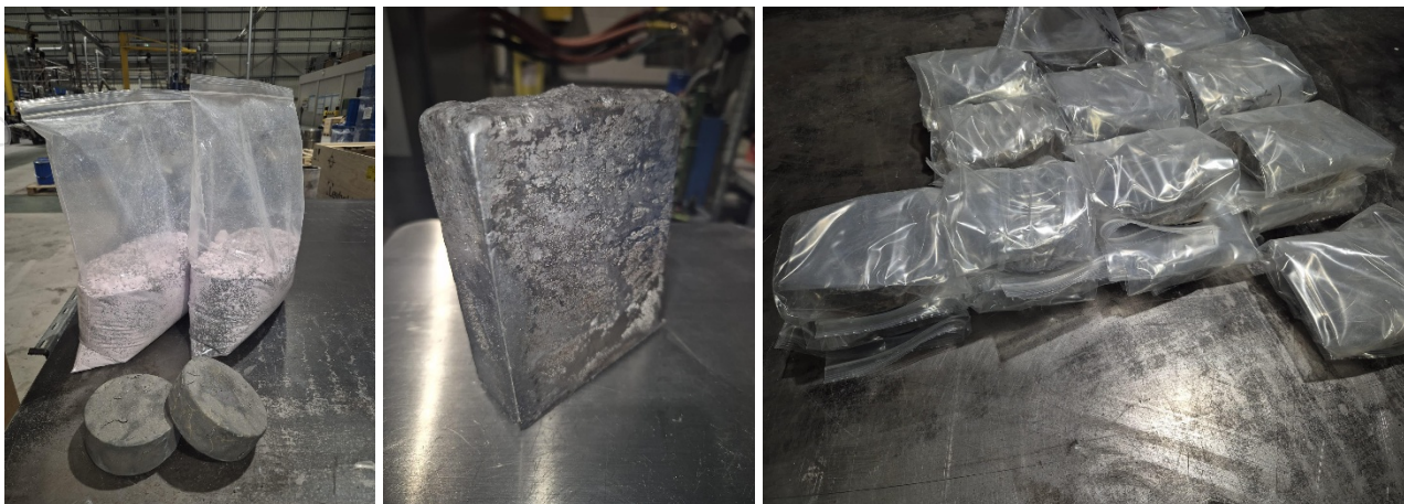
Figure 1: Neodymium ingots, after reduction, and Dysprosium (centre) and Terbium ingots (right) after Vacuum remelting.

The recycled material from Ionic Technologies, used to produce alloy by LCM, was made into finished NdFeB magnets at GKN's manufacturing site in Radevormwald, Germany. The recycled material behaved in the same way as flakes made from mined material during manufacture and produced magnets of the same end specification and performance.