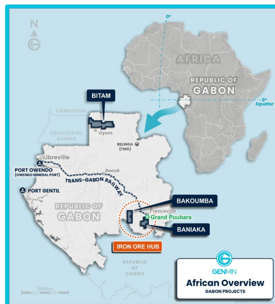
Location map of Genmin’s projects in Gabon

The Production Targets for Baniaka were presented in an announcement released on 16 November 2022 titled “Positive Baniaka PFS” and is available to view at www.genmingroup.com/investors/asx-announcements . Genmin confirms that it is not aware of any new information or data that materially affects the information included in the original market announcement and that all material assumptions and technical parameters underpinning the estimated Production Targets in the original market announcement continue to apply and have not materially changed.