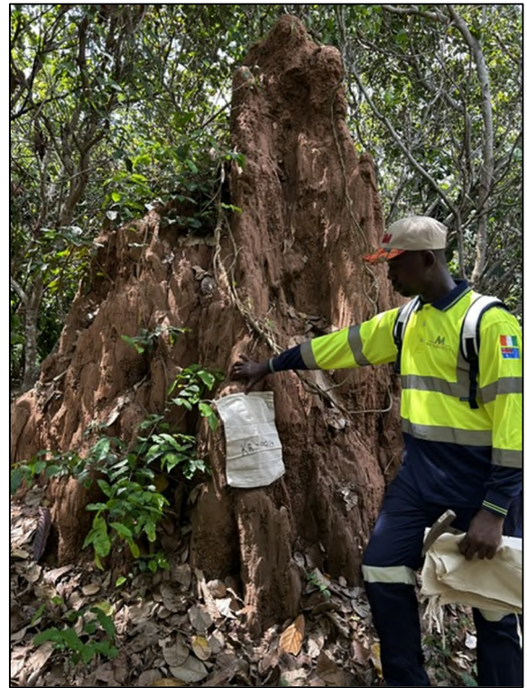
Figure 2. Sampling of Termite Mounds at Fifty-Five Prospect