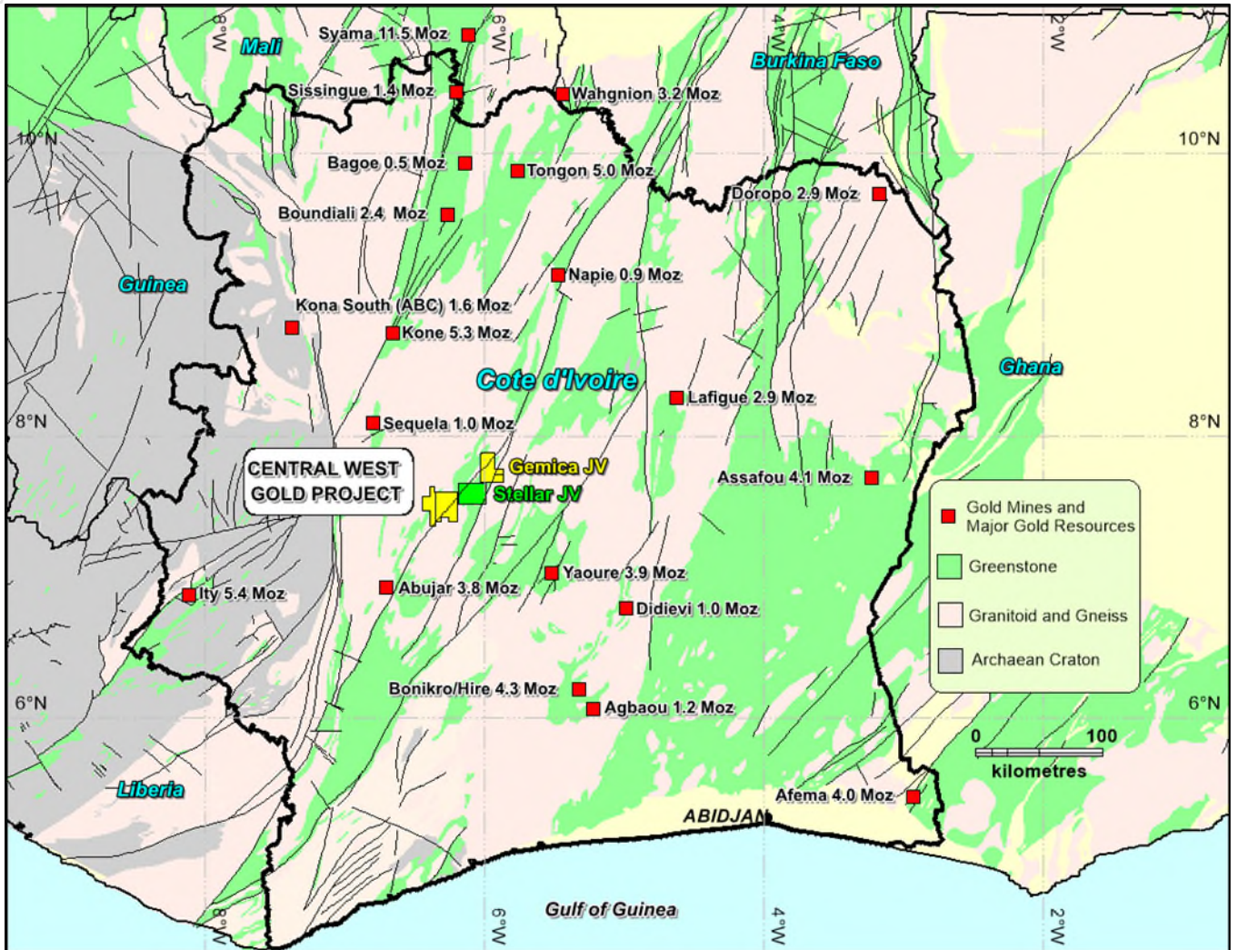
Figure 4. Map illustrating location of Central West Gold Project permits in Côte d'Ivoire

The Company's Central West Gold Project comprising the Gemica JV and Stellar JV permits cover a combined area of 1,315 km 2 strategically situated along the Abujar–Napié gold trend within the Oumé–Fetekro Birimian greenstone belt in central Côte d'Ivoire, 100km north of the Abujar Gold Mine and 160 km south of the Napié Gold Deposit (Figure 4). Further details of the permits are provided in Table 1.