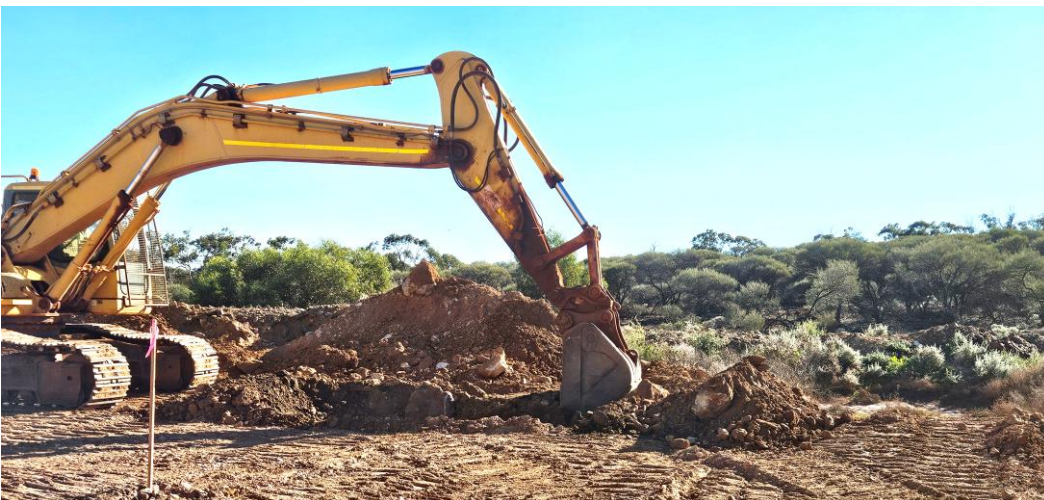
Image set 1: Three images showing on-site works underway at Mt Mulgine ahead of the planned RC and diamond drilling at Mulgine Trench