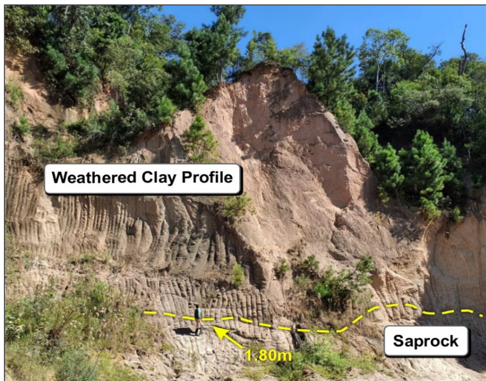
Figure 1: CR3 geologist at Três Córregos Granite outcrop on the Campo Largo Project, exhibiting an extensive weathering profile.

“Our field team has completed the initial ground works, including connection with our local stakeholders in preparation for the next phase of work, commencing in the current quarter, which will involve systematic auger drill testing of the highlighted target areas.”