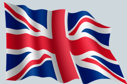
TAM 45,000 SITES