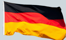
TAM 90,000 SITES