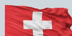
TAM 10,000 SITES