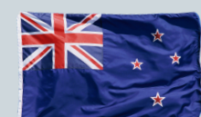
TAM 3,000 SITES