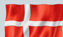
TAM 10,000 SITES