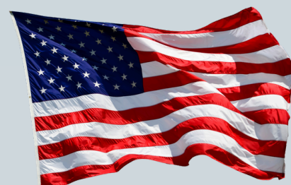
TAM 2bn PARKING SPACES