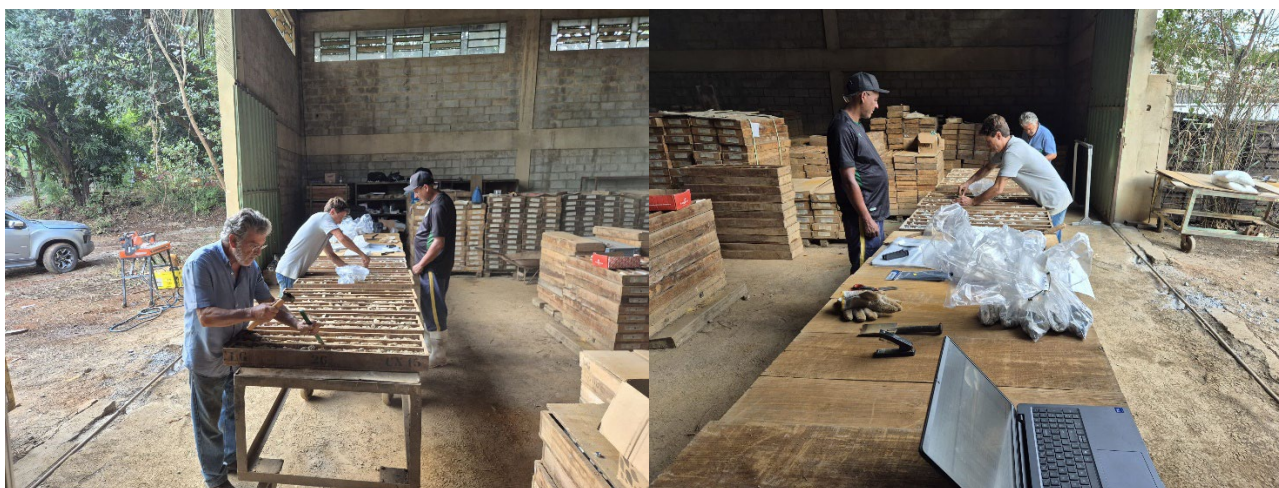
Photo 3 & 4: Consultant geologists and field technicians preparing Serra Negra diamond drilling core for sampling.

The initial 10-20 holes of the historic core will be processed at the current storage facility in Belo Horizonte, while the Company identifies and leases a processing and storage warehouse closer to Serra Negra, in the nearby town of Patrocinio (~20km west the Project).