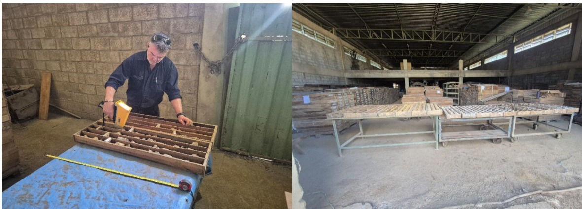
Photo 1: Oceana's Gareth Reynolds taking pXRF readings of historic core; Photo 2: ~8000m of palletised core available for re-assay.

The initial 10-20 holes of the historic core will be processed at the current storage facility in Belo Horizonte, while the Company identifies and leases a processing and storage warehouse closer to Serra Negra, in the nearby town of Patrocinio (~20km west the Project).