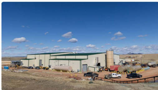
Central Processing Plant (Phase I & II)